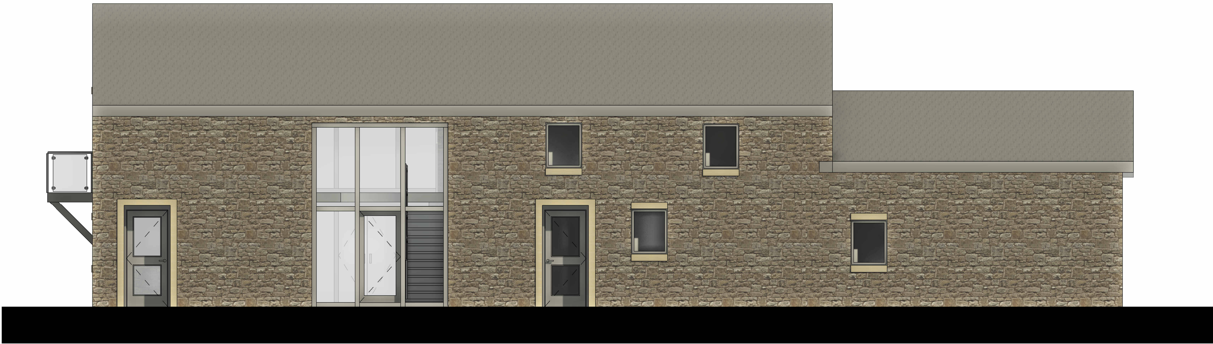
2 PROPOSED WEST 1 : 50