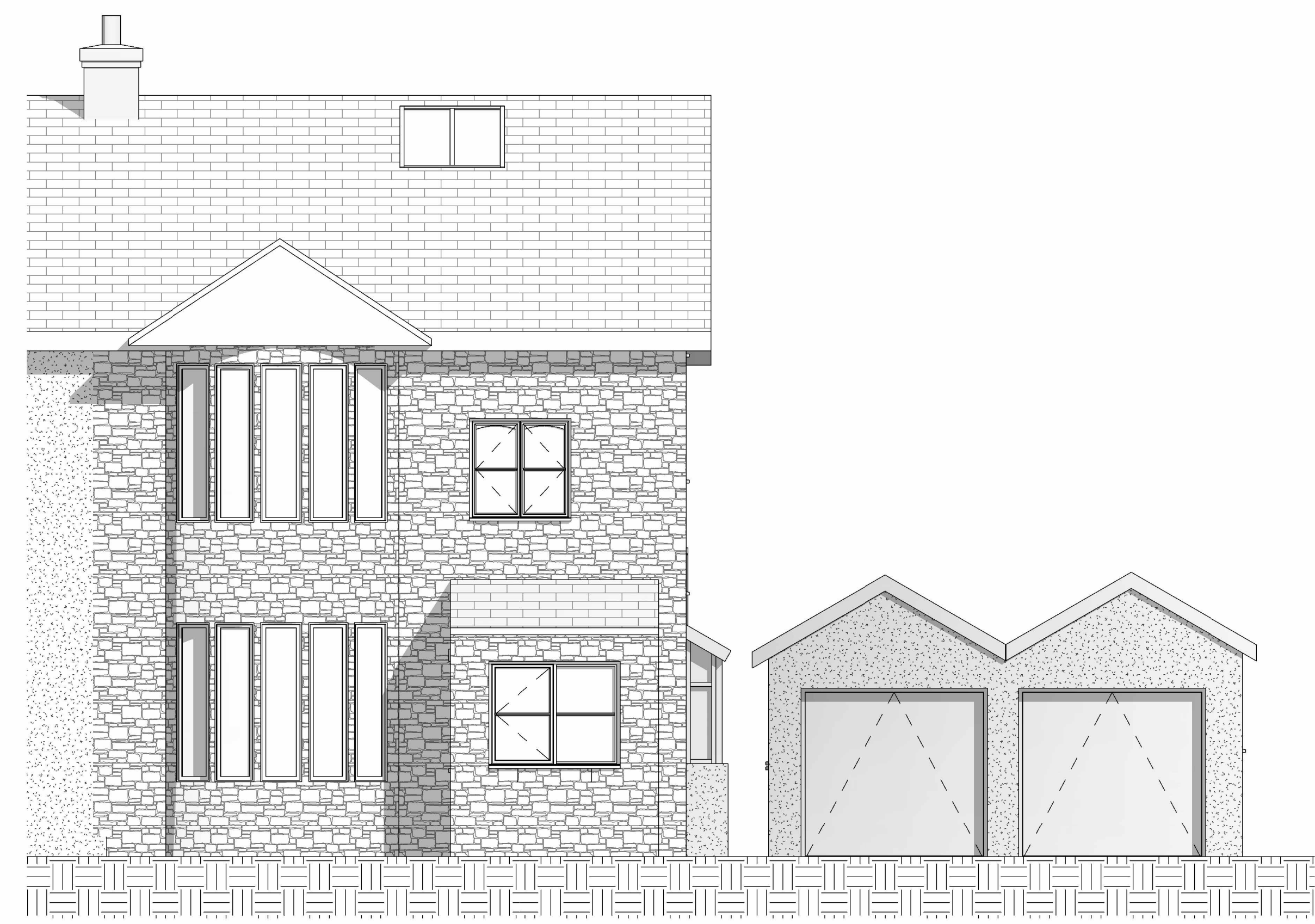
1 EXISTING SOUTH ELEVATION 1 : 50