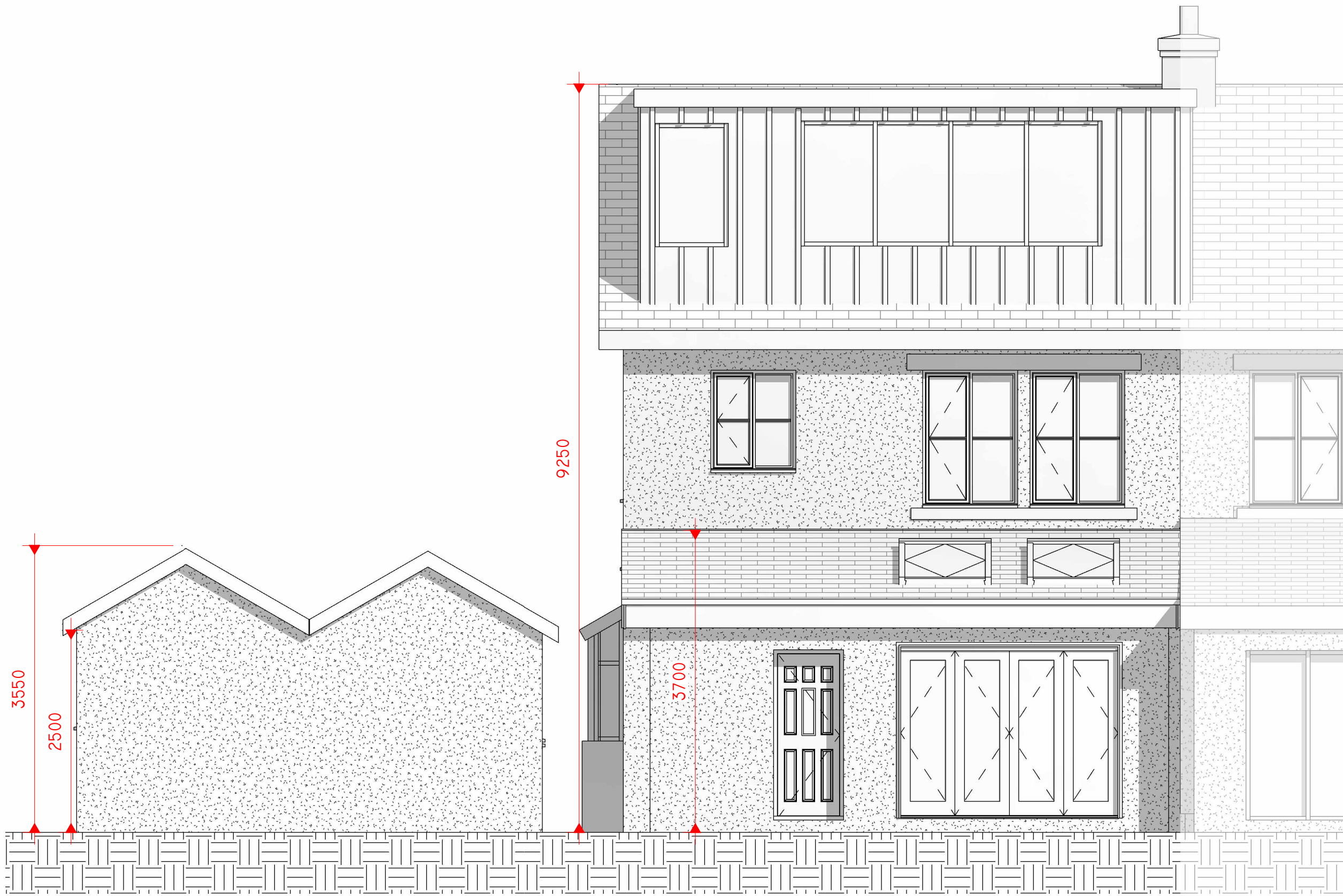
1 PROPOSED NORTH. 1 : 50