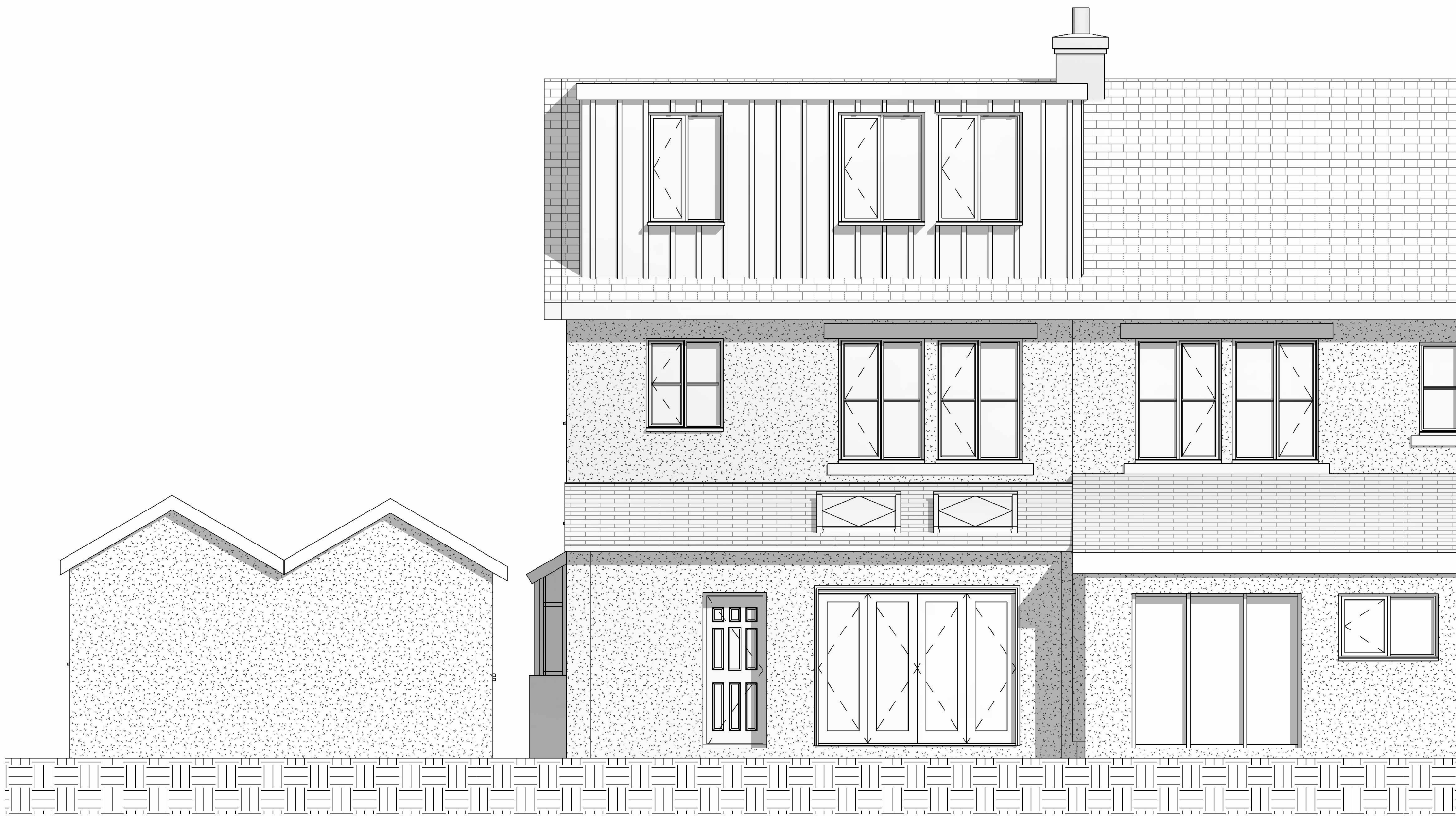
1 PROPOSED NORTH 1 : 50