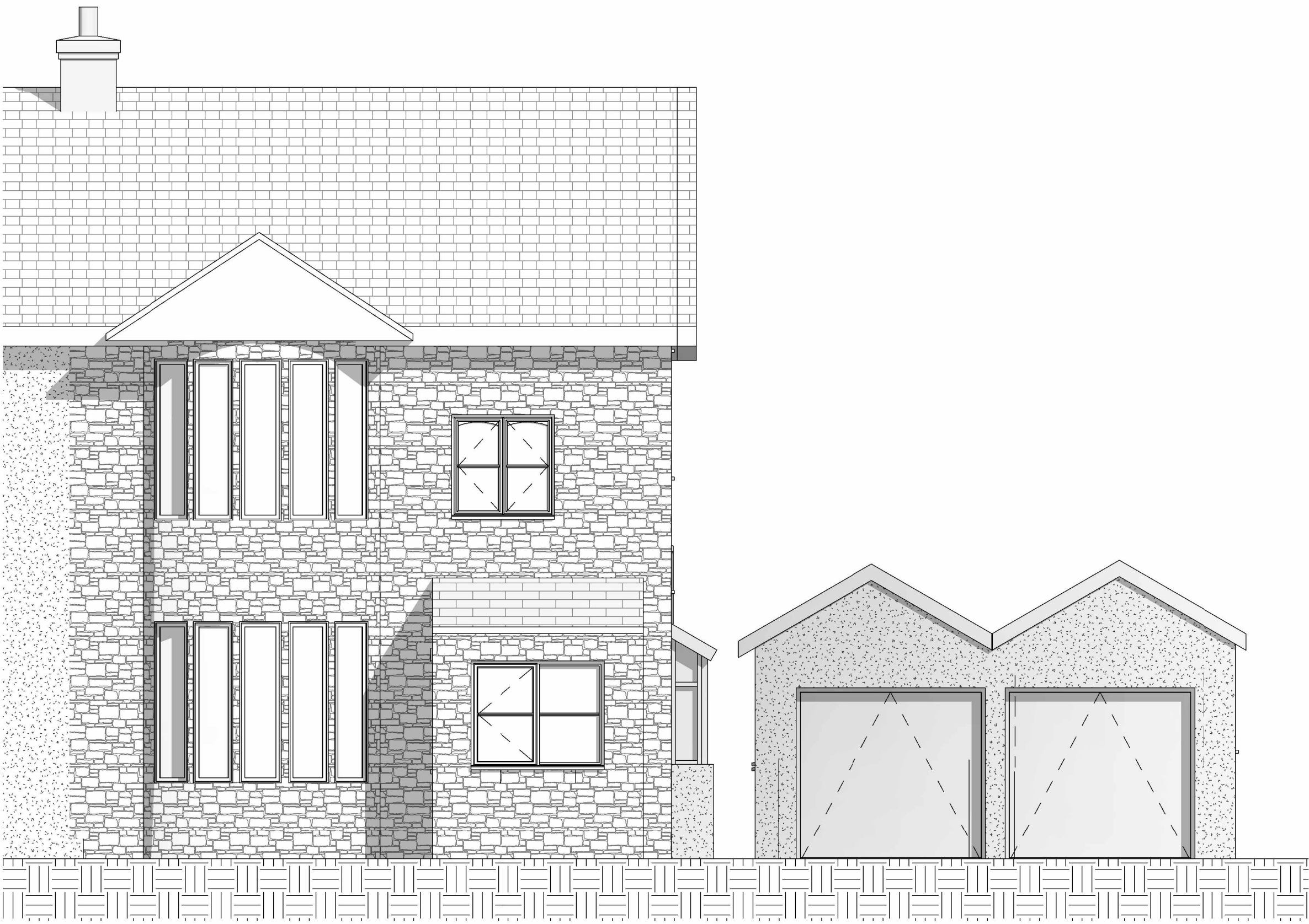
1 EXISTING SOUTH ELEVATION 1 : 50