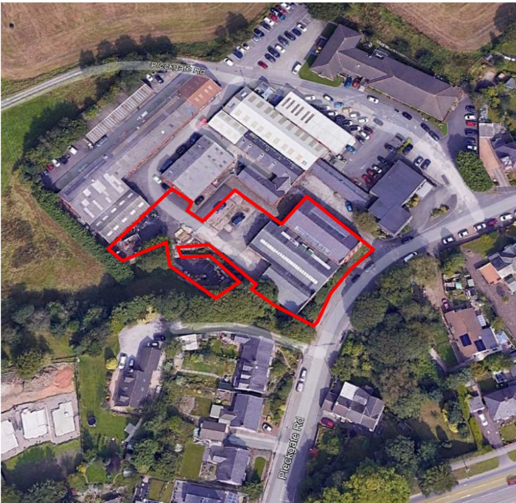
Figure 1.1: Site at Ramsgreave Business Park, Blackburn

The site is located at Ramsgreave Business Park, Pleckgate Rd, Blackburn. The sites central grid reference is SD 6816 3085 and the site location is shown below.