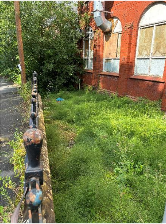
Photograph 1: Ruderal/ephemeral growing on u1c artificial substrate.