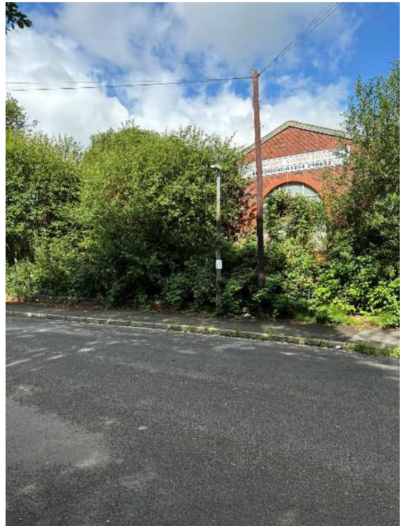
Photograph 3: Mixed scrub comprising willow and bramble.