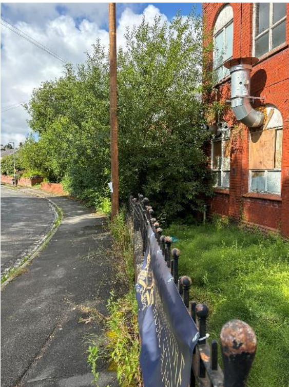
Photograph 2: Overview of only habitats present within the site, along Pleckgate Road.