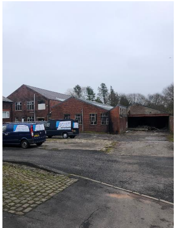
Photograph 4: Remainder of site is hard standing and buildings.