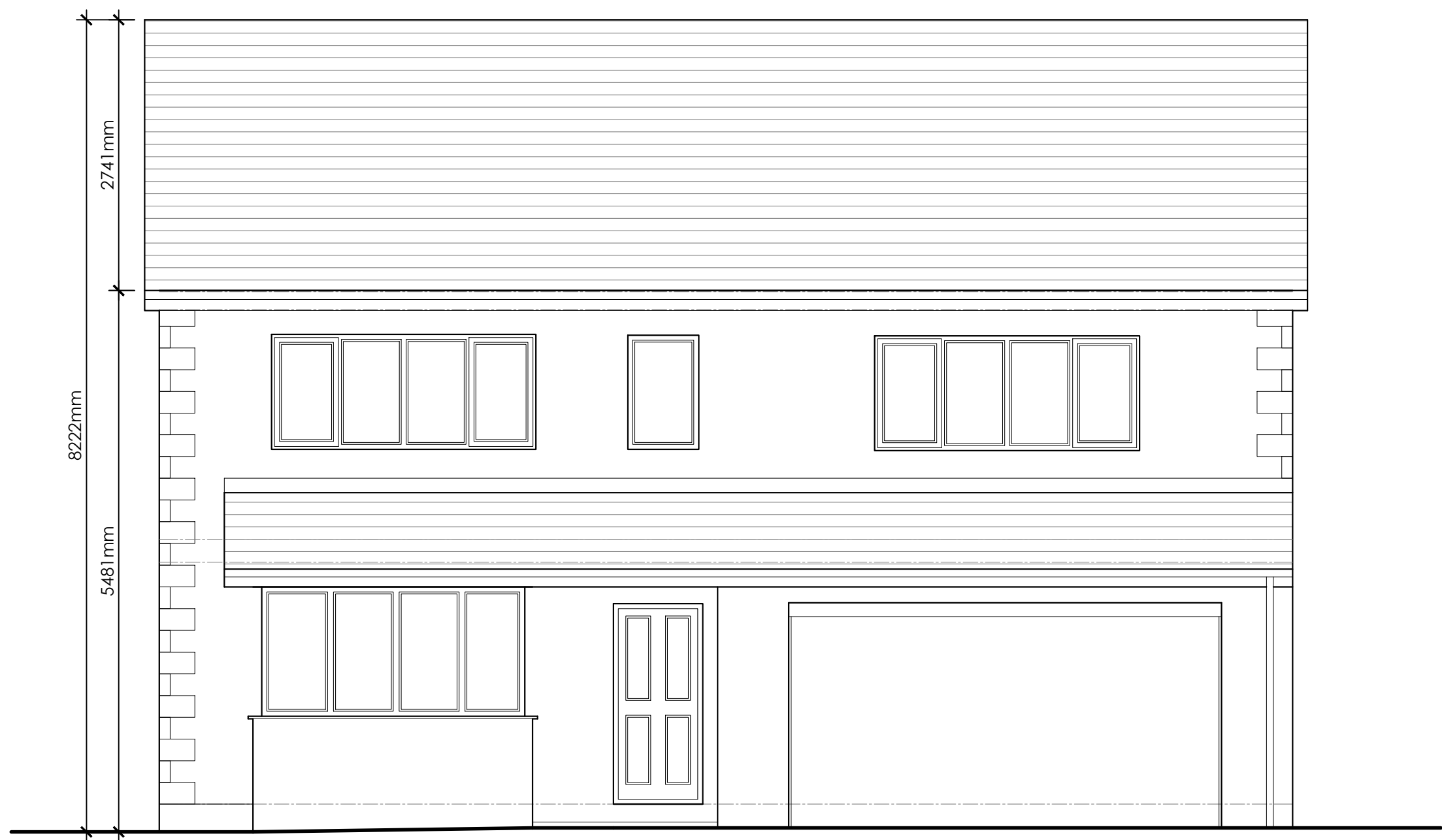
PROPOSED FRONT (SOUTH EAST) ELEVATION - Scale 1:50