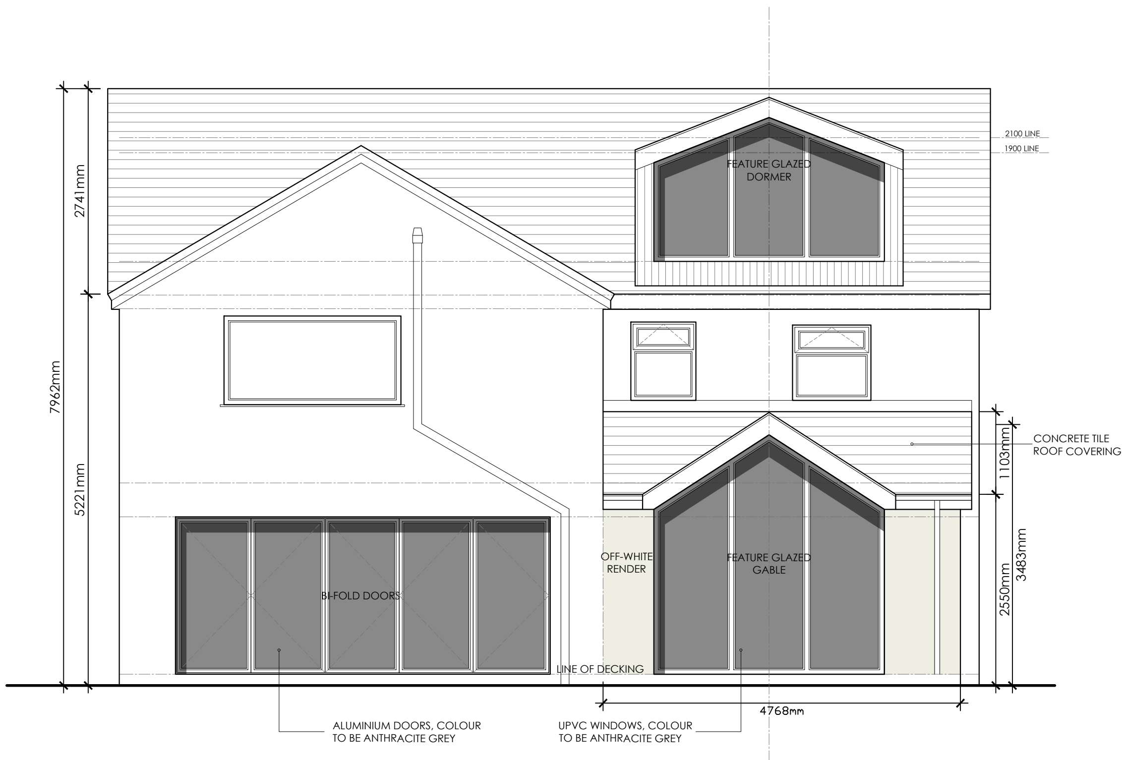
PROPOSED REAR (NORTH WEST) ELEVATION - Scale 1:50