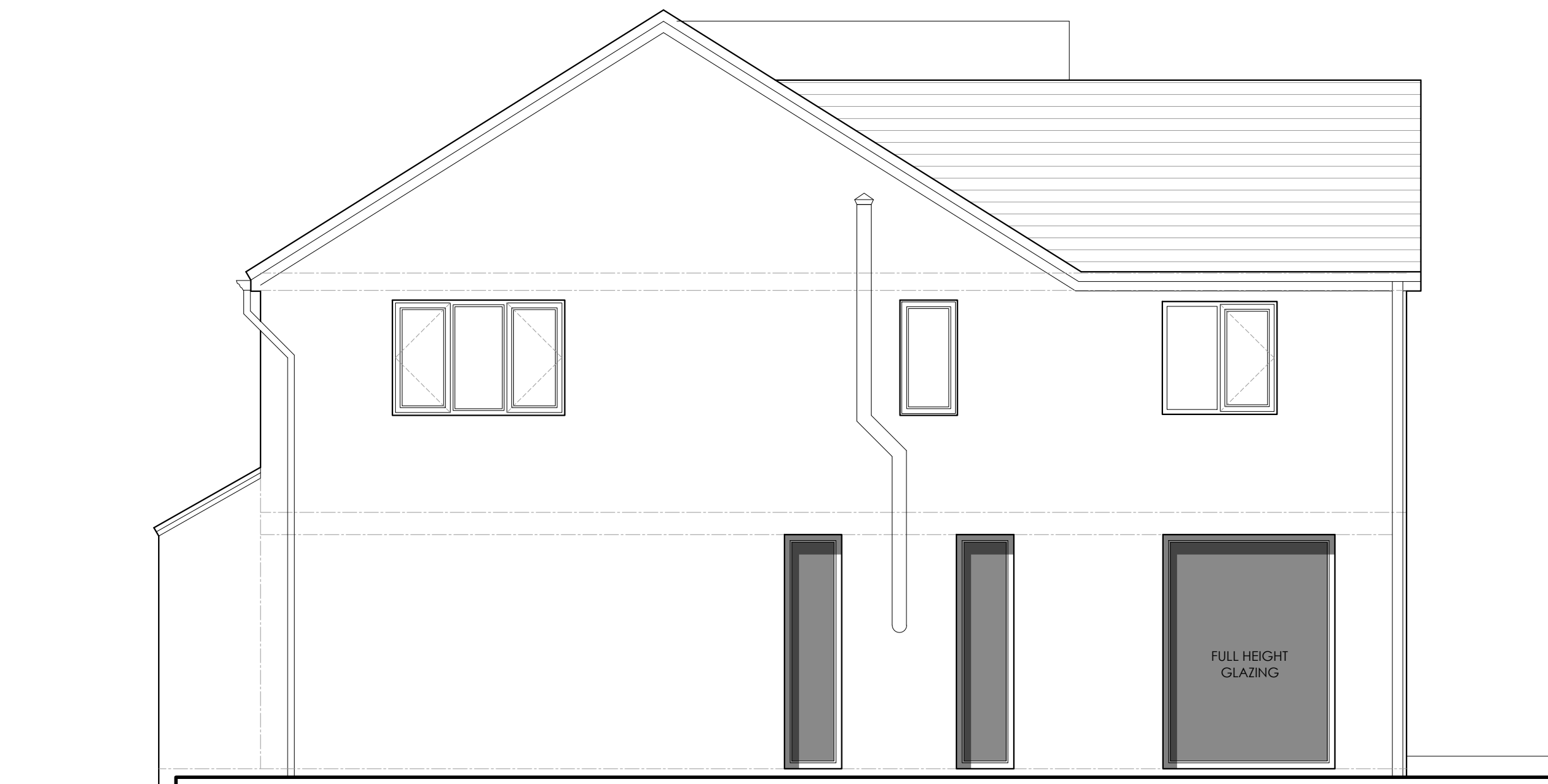
PROPOSED SIDE (NORTH EAST) ELEVATION - Scale 1:50