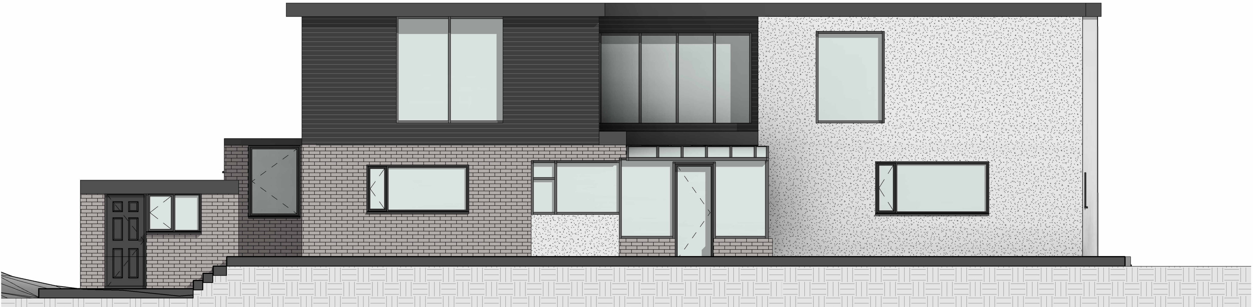
3 PROPOSED SOUTH-EAST 1 : 50