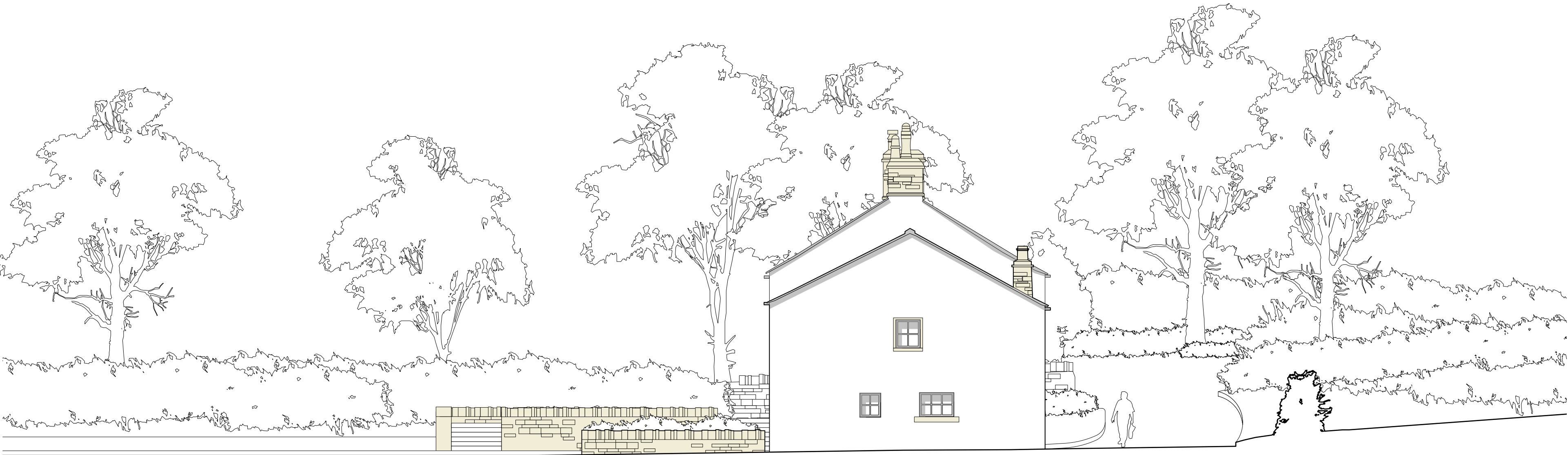
north east elevation