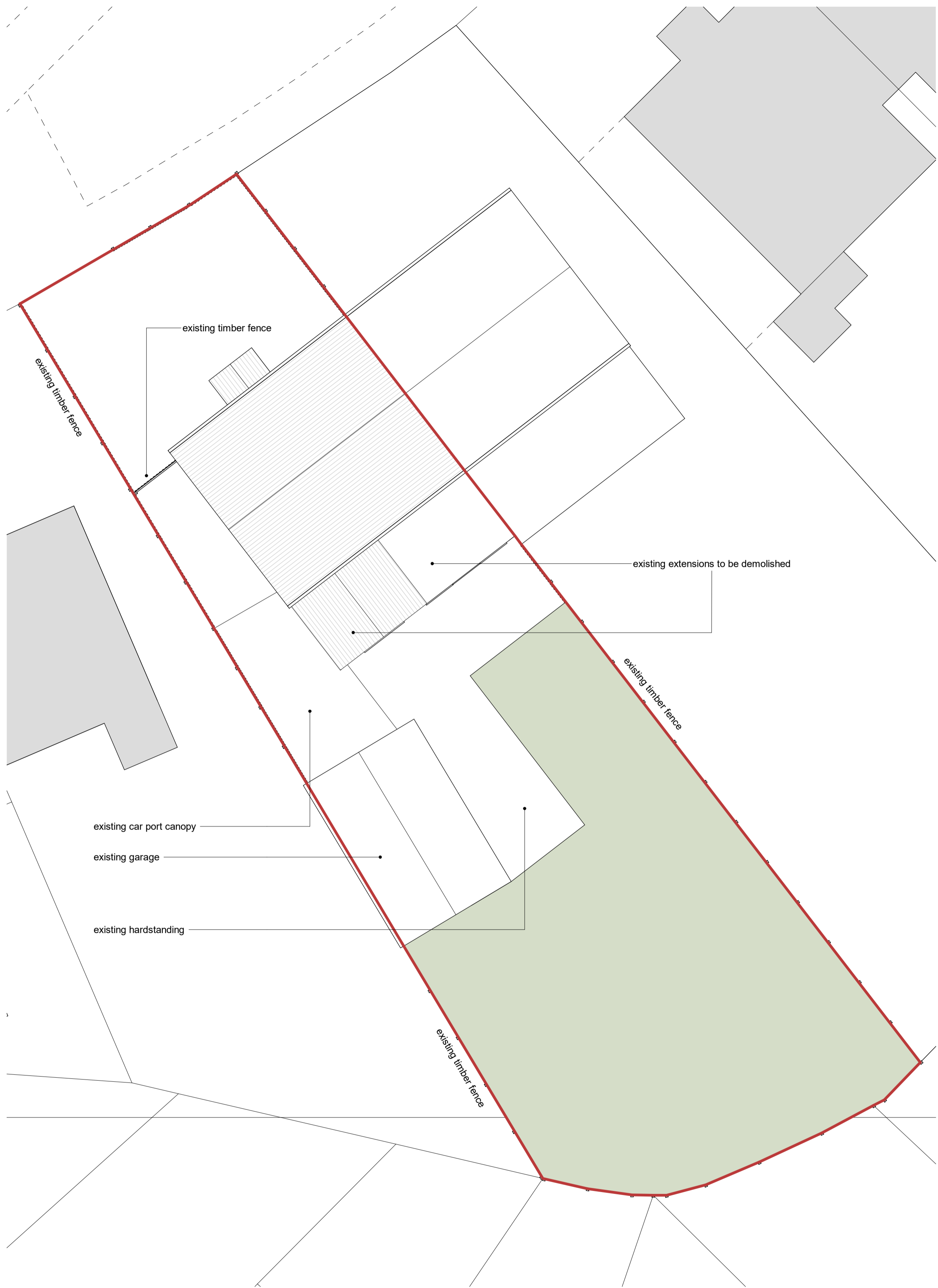
1 Existing Site Plan 1 : 100