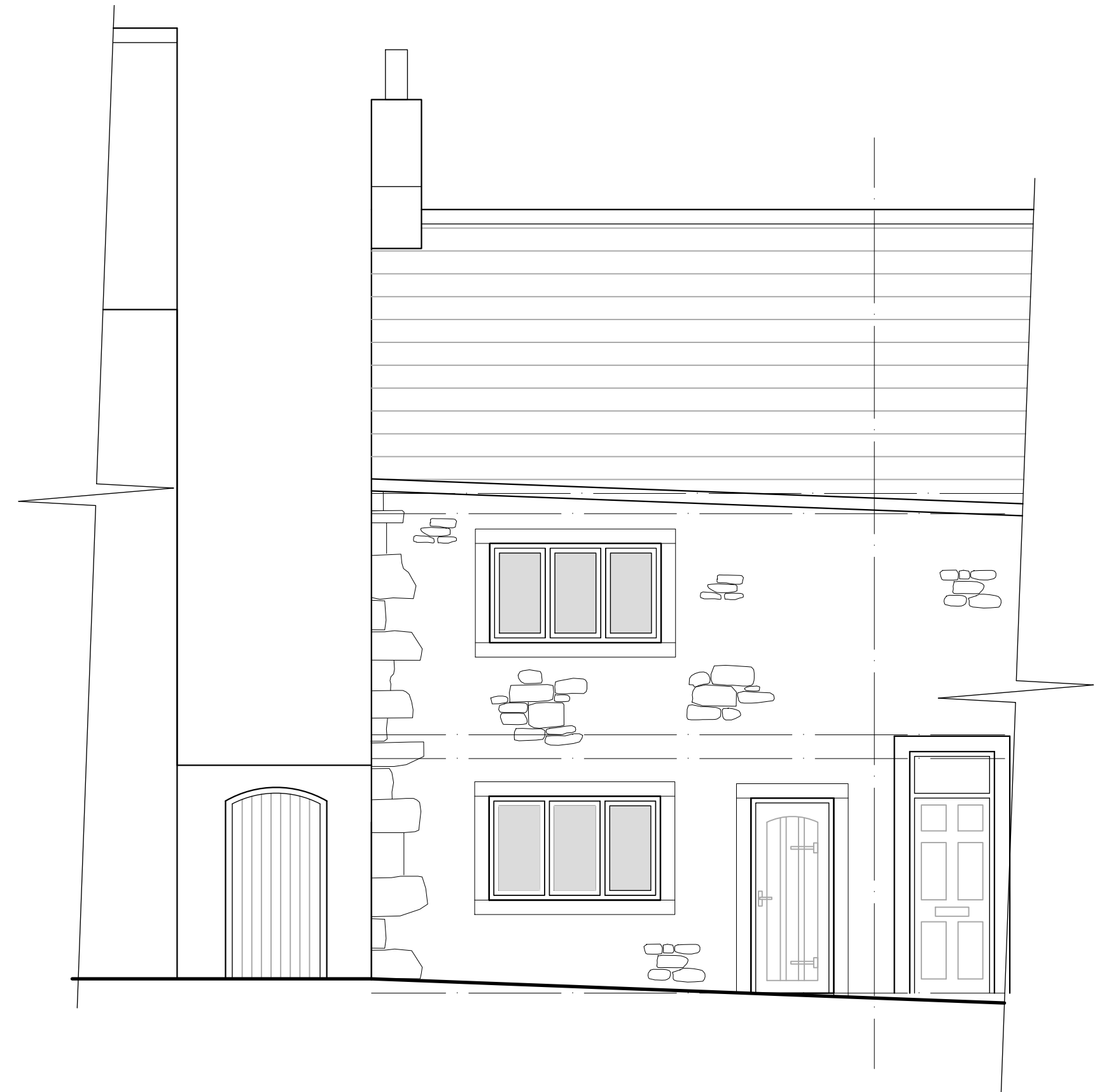
Front Elevation (South) 1:50 Scale