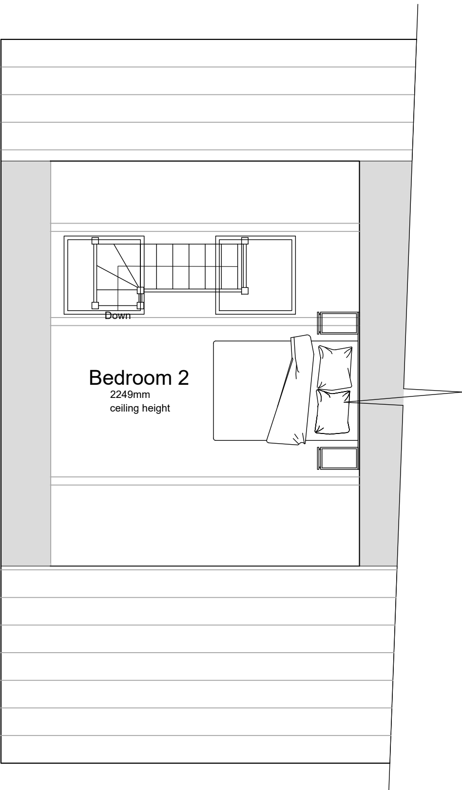
2nd Floor (Loft) 1:50 Scale