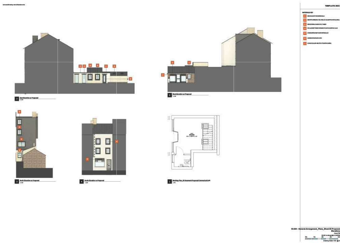
Figure C -Proposed Elevations