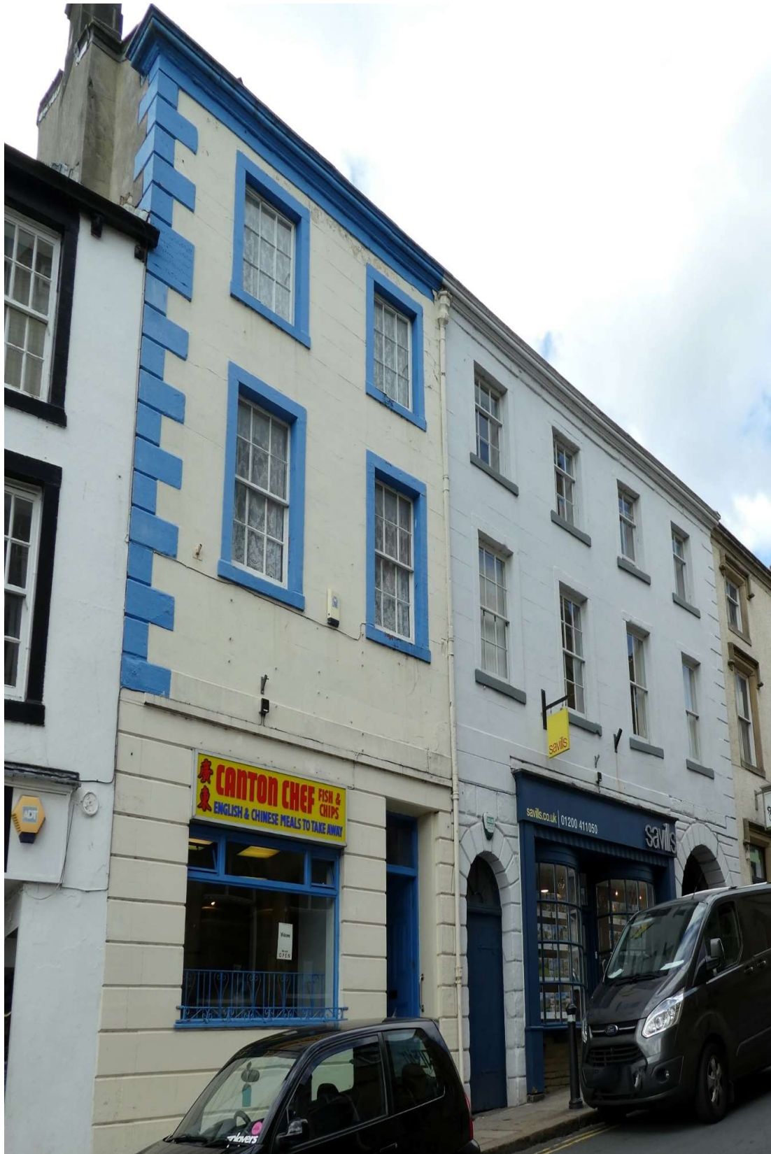
Appendix – A - https://historicengland.org.uk/listing/the-list/list-entry/1072377