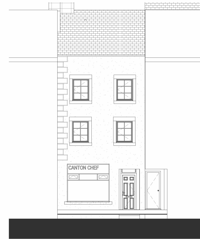
4 South Elevation 1:100