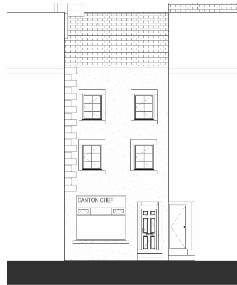
4 South Elevation 1:100