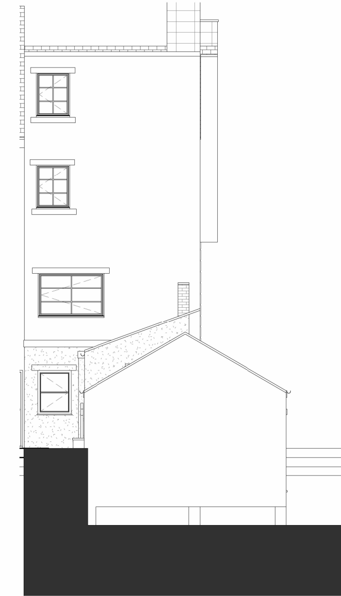
3 North Elevation 1:100