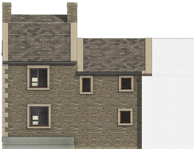
2 EXISTING EAST 1 : 50