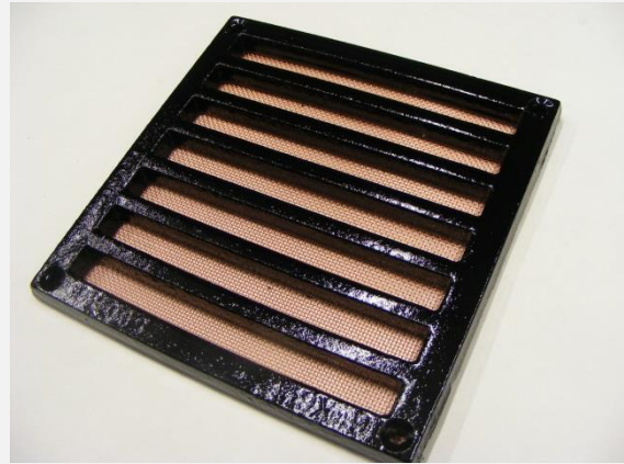
Above Left – 3” slotted – available in various lengths