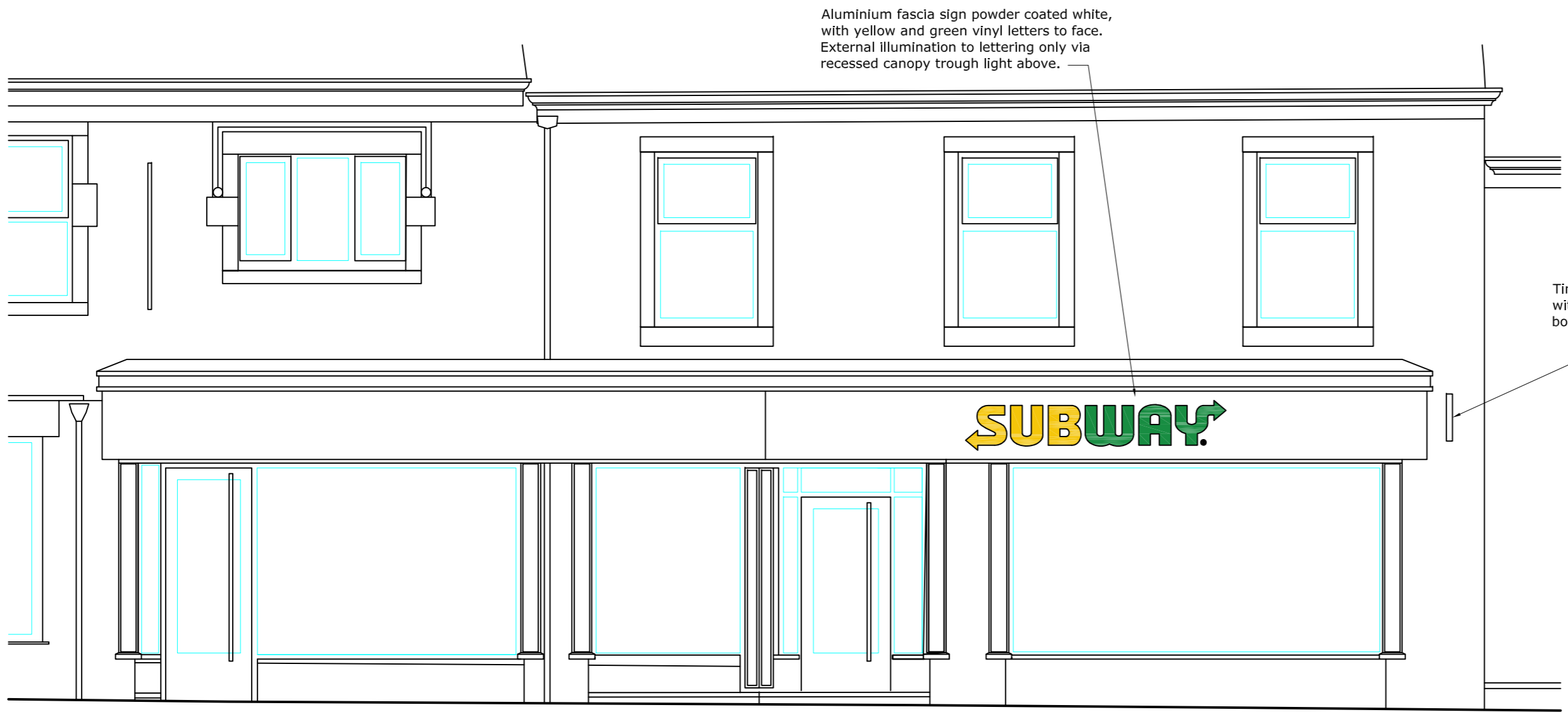
CURRENT FRONT ELEVATION