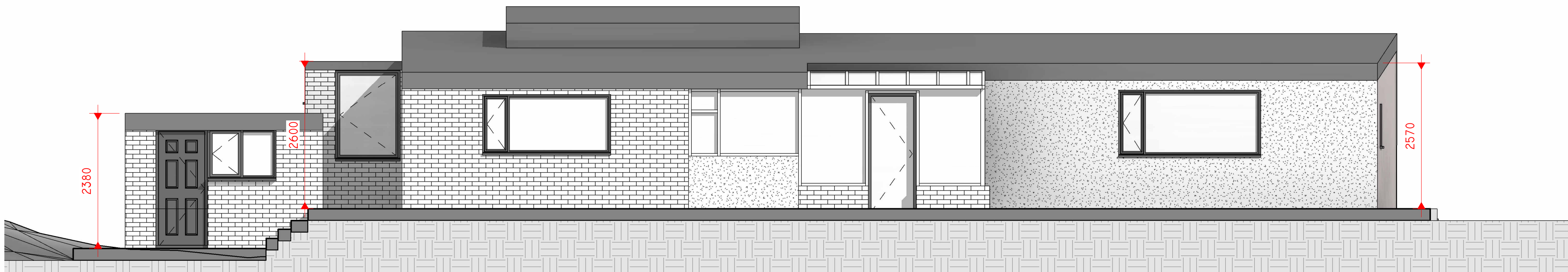
3 EXISTING SOUTH-EAST 1 : 50