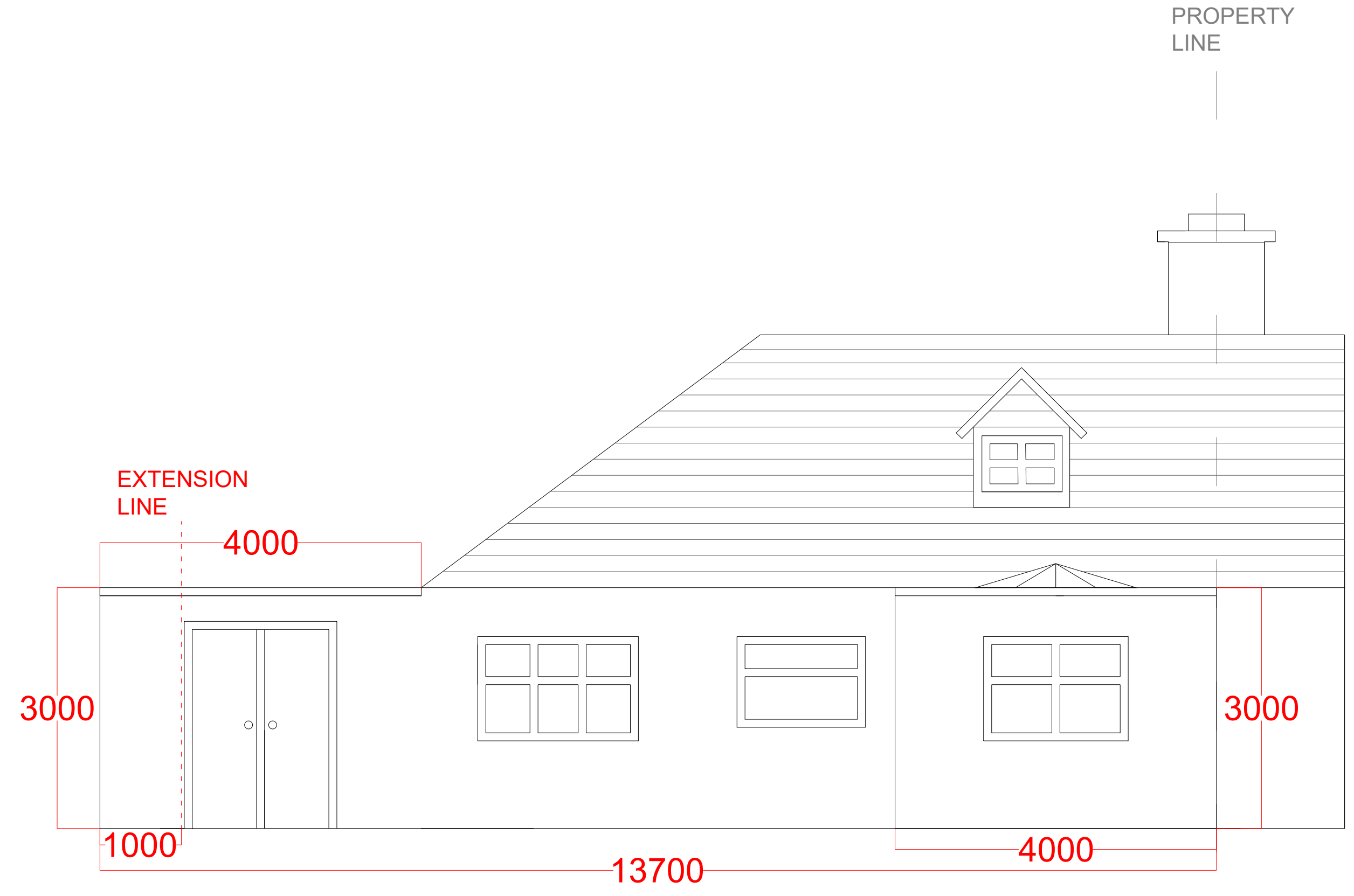
PROPOSED REAR ELEVATION NORTH-EAST