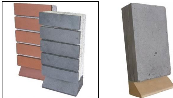
Example of Habitat boxes Can also be faced with stone.

“Designed to be built into an exterior wall and is available in a variety of faces to match the building. Standard facings of red or blue brick - ideal for new builds - are normally available from stock, or boxes can be made to your specific requirements with a face of brick, stone, timber, or plain (for rendering). Supplied un-pointed.”