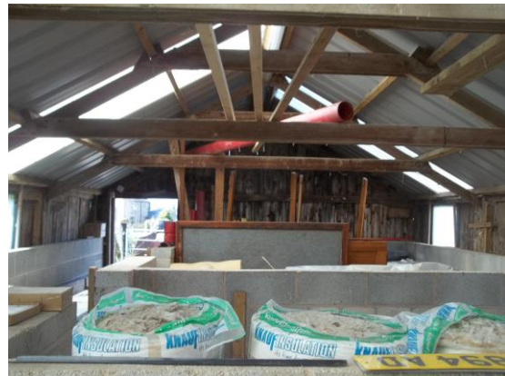
Interior of larger and smaller buildings respectively

The stables, which weren't surveyed in 2020, are also single-skinned of wood with a corrugated roof: