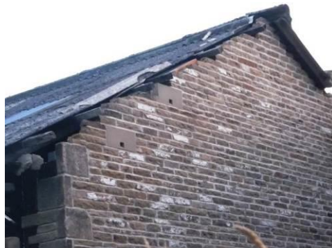
Example of Forticrete boxes in situ

A similar box is available from Habibat. See above listing.