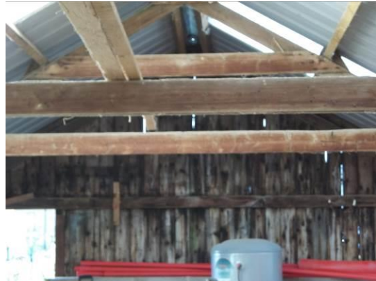
Interior of larger and smaller building

The roof of the larger is of asbestos sheeting, and of the smaller is metal sheeting: