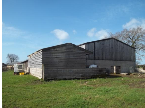
Front and rear elevations

They are in a rural location about 150m from the nearest woodland: