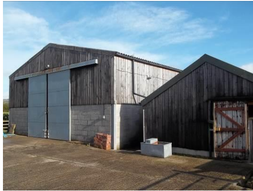
Front of both buildings