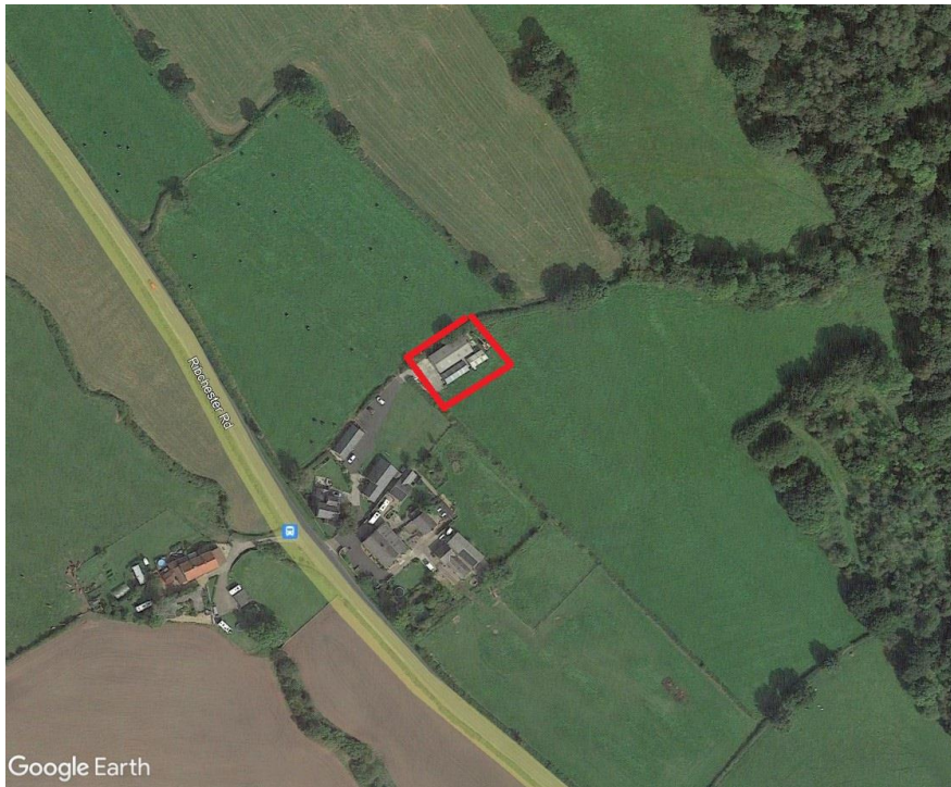
Three buildings: larger to north, smaller with stables behind to south

They are in a rural location about 150m from the nearest woodland: