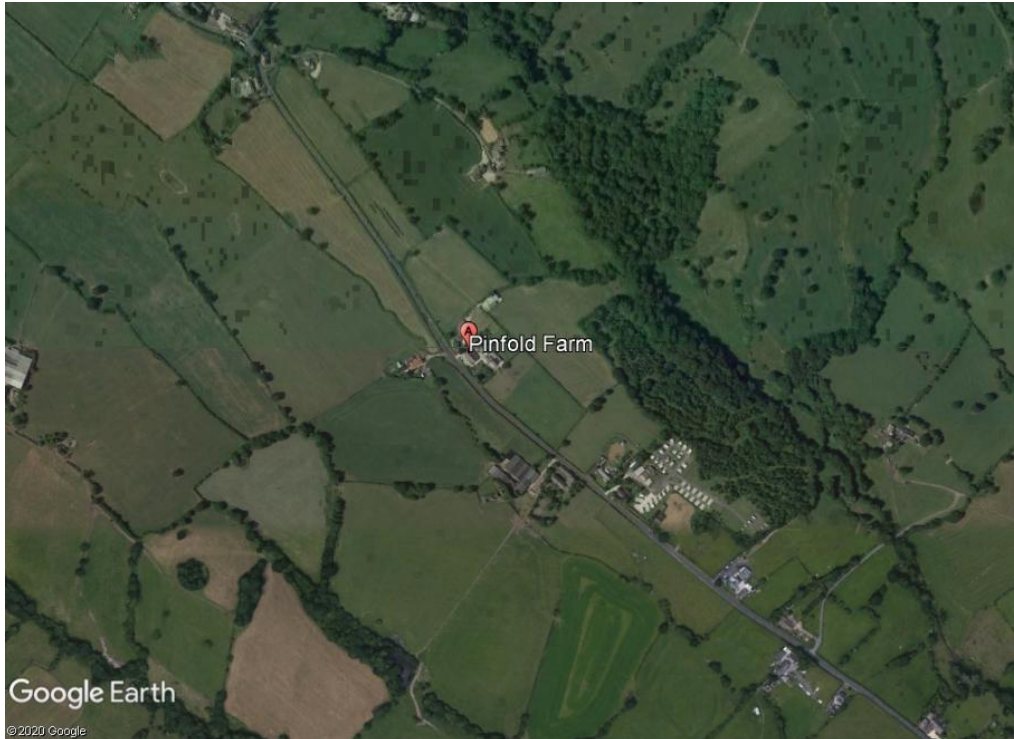
Location of Pinfold Farm

The pipistrelle bat (2 species: Pipistrellus pipistrellus - the common pipistrelle, and Pipistrellus pygmaeus - the soprano pipistrelle) is common and widespread in the area.