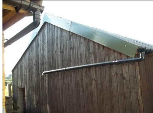
Rear of larger and smaller building

They are in a rural location about 150m from the nearest woodland: