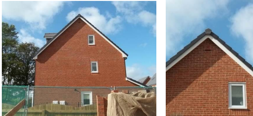
Above: typical unit in situ.