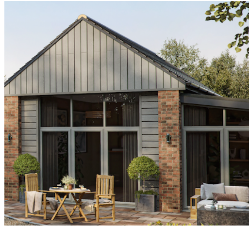
Example RAL 7006 Windows