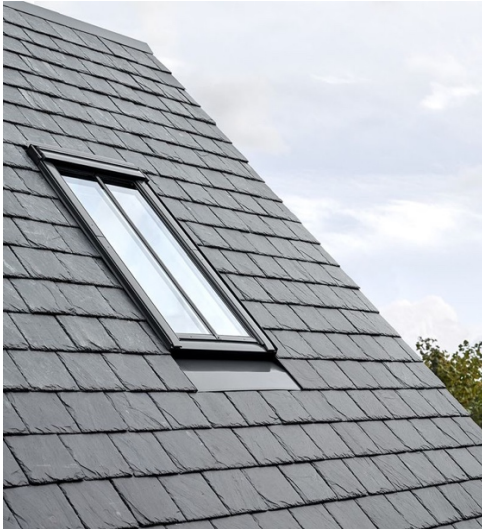
Fig: 12 Example new Velux Conservation style window for roof windows