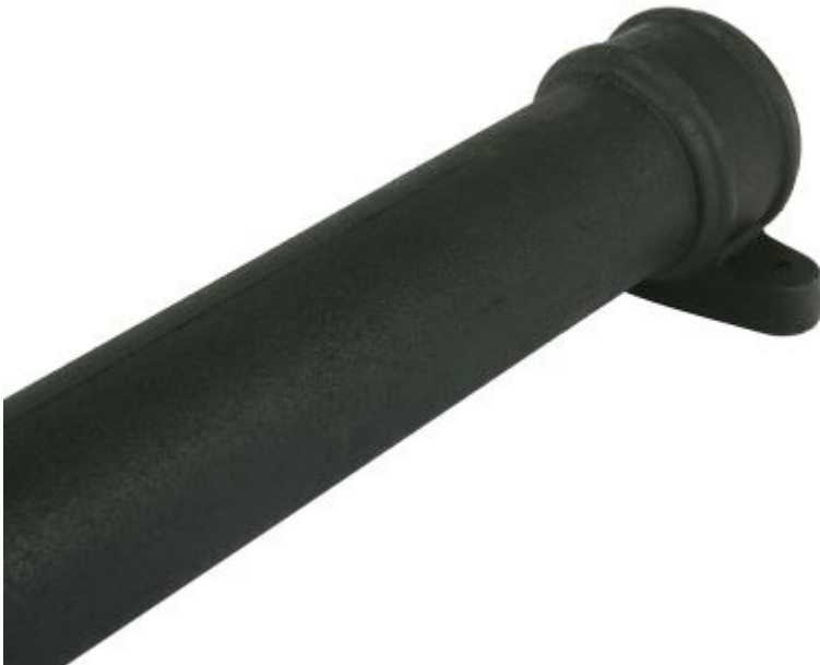
Fig: 13 Example Cast Iron Style rainwater pipe/fitting

Brett Martin Cascade or similar Cast Iron Style black rainwater goods