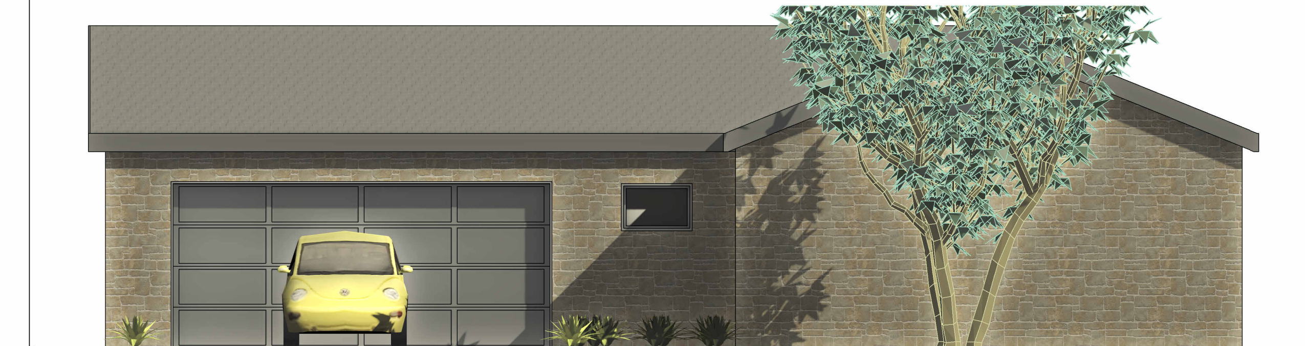
4 PROPOSED WEST 1 : 50