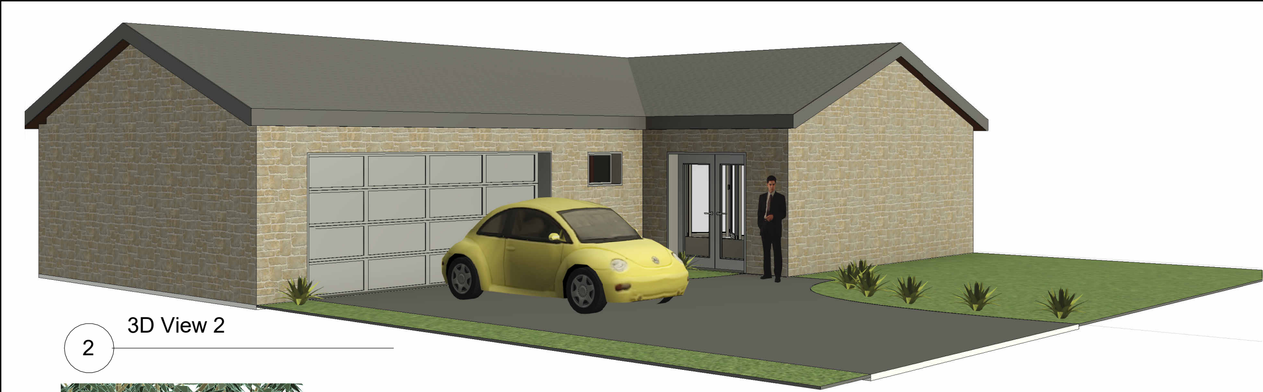
2 3D View 2