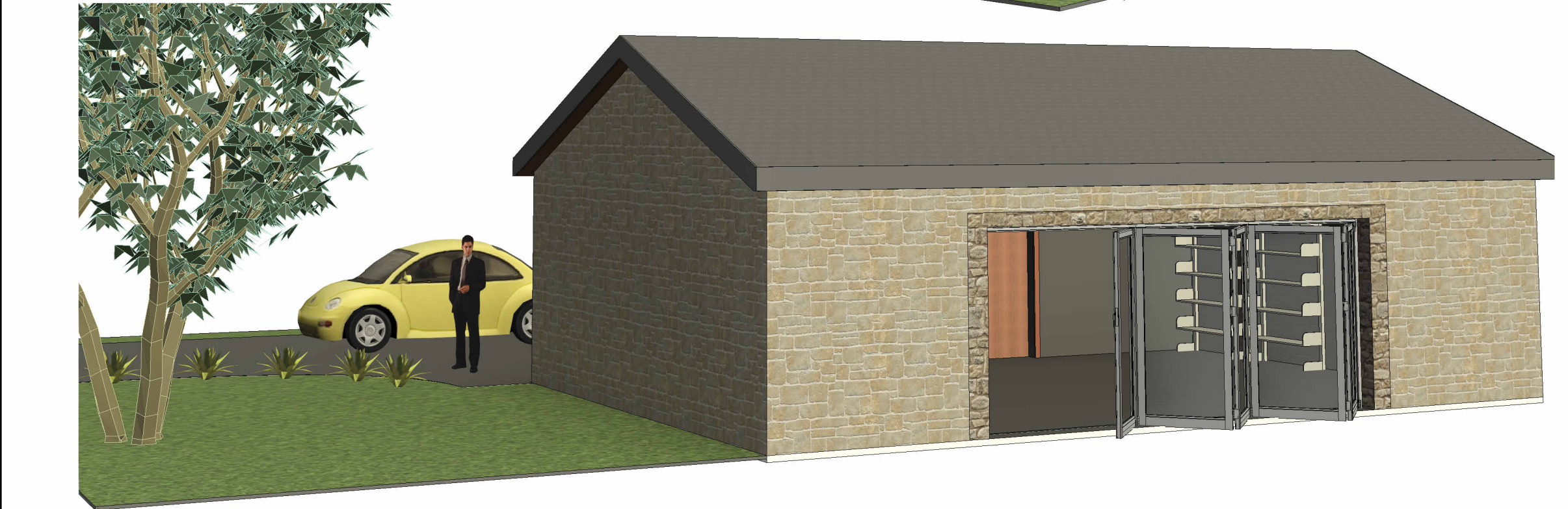
3 3D View 3