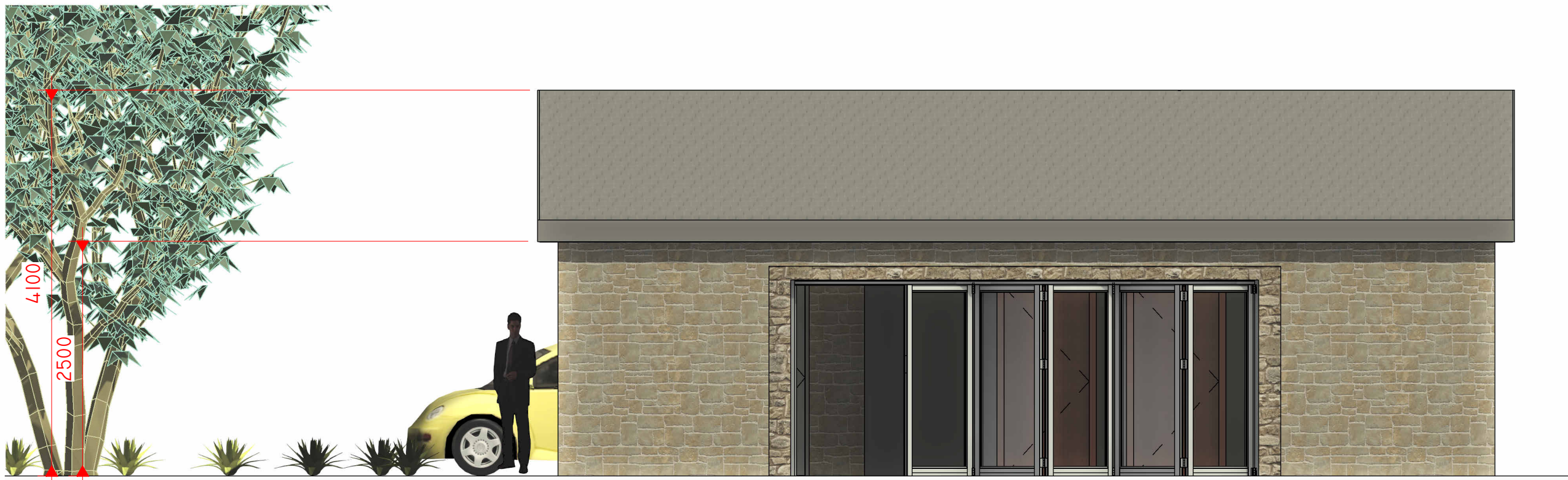
5 PROPOSED SOUTH 1 : 50