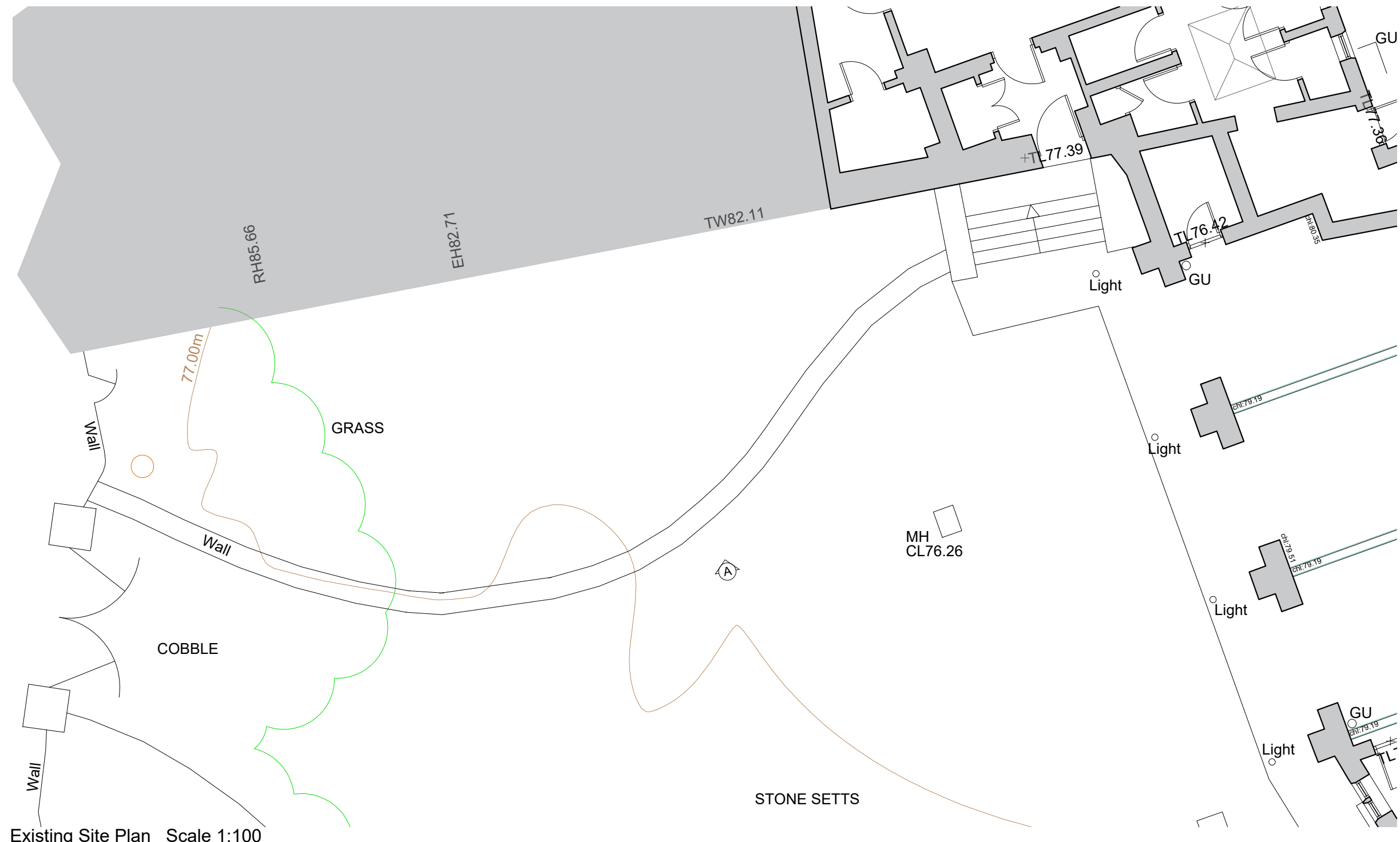
Existing Site Plan Scale 1:100