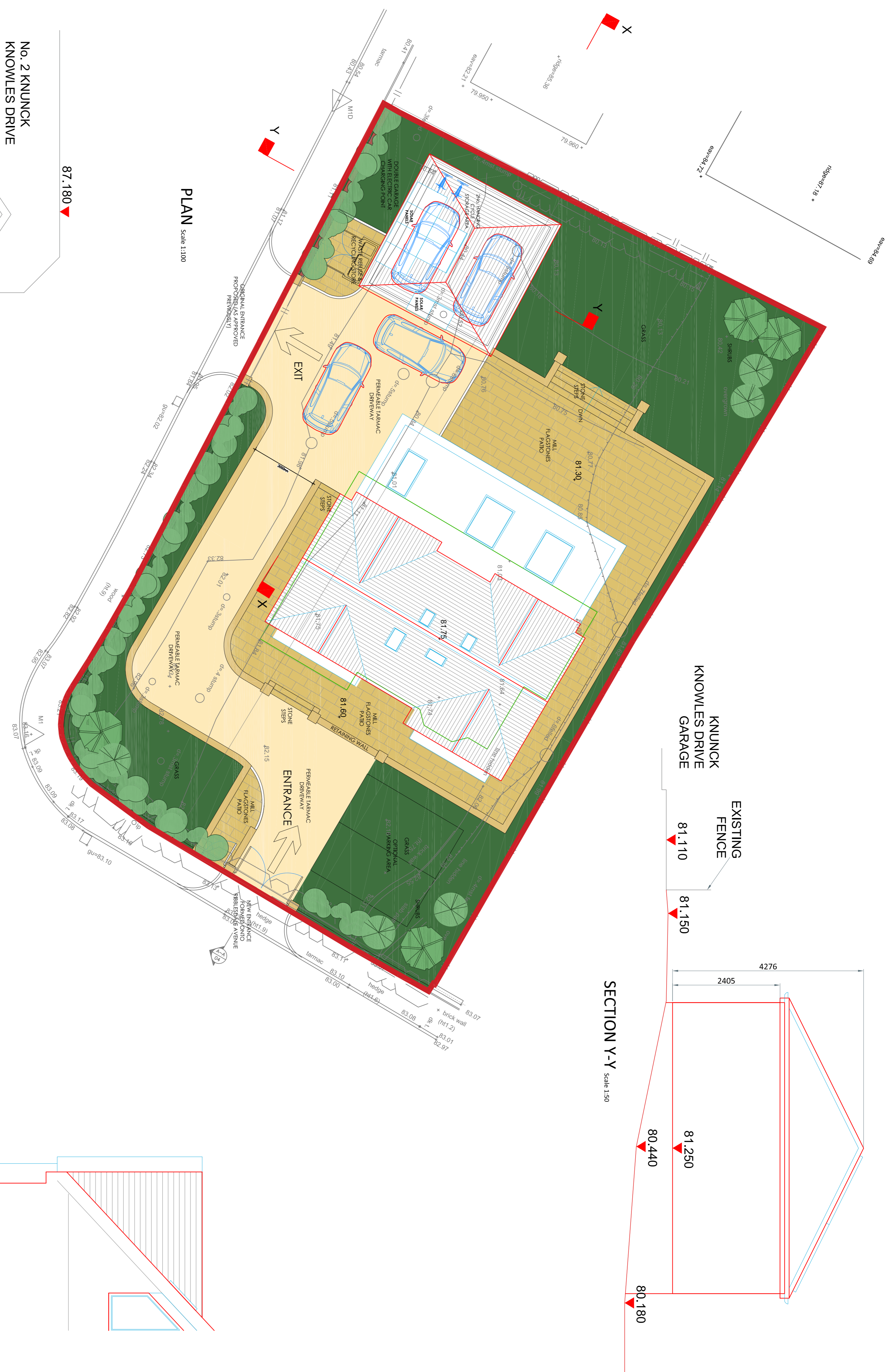
PLAN Scale 1:100