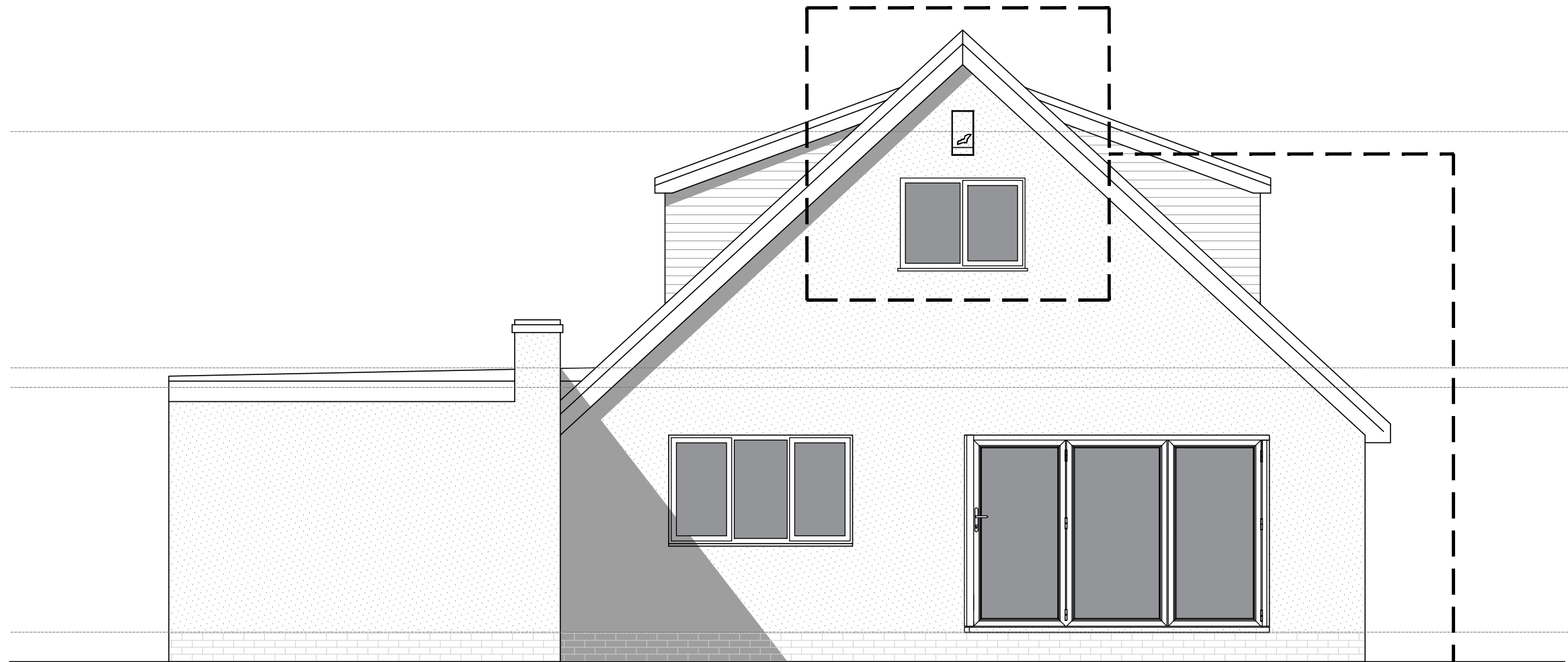
Rear Elevation 1:50