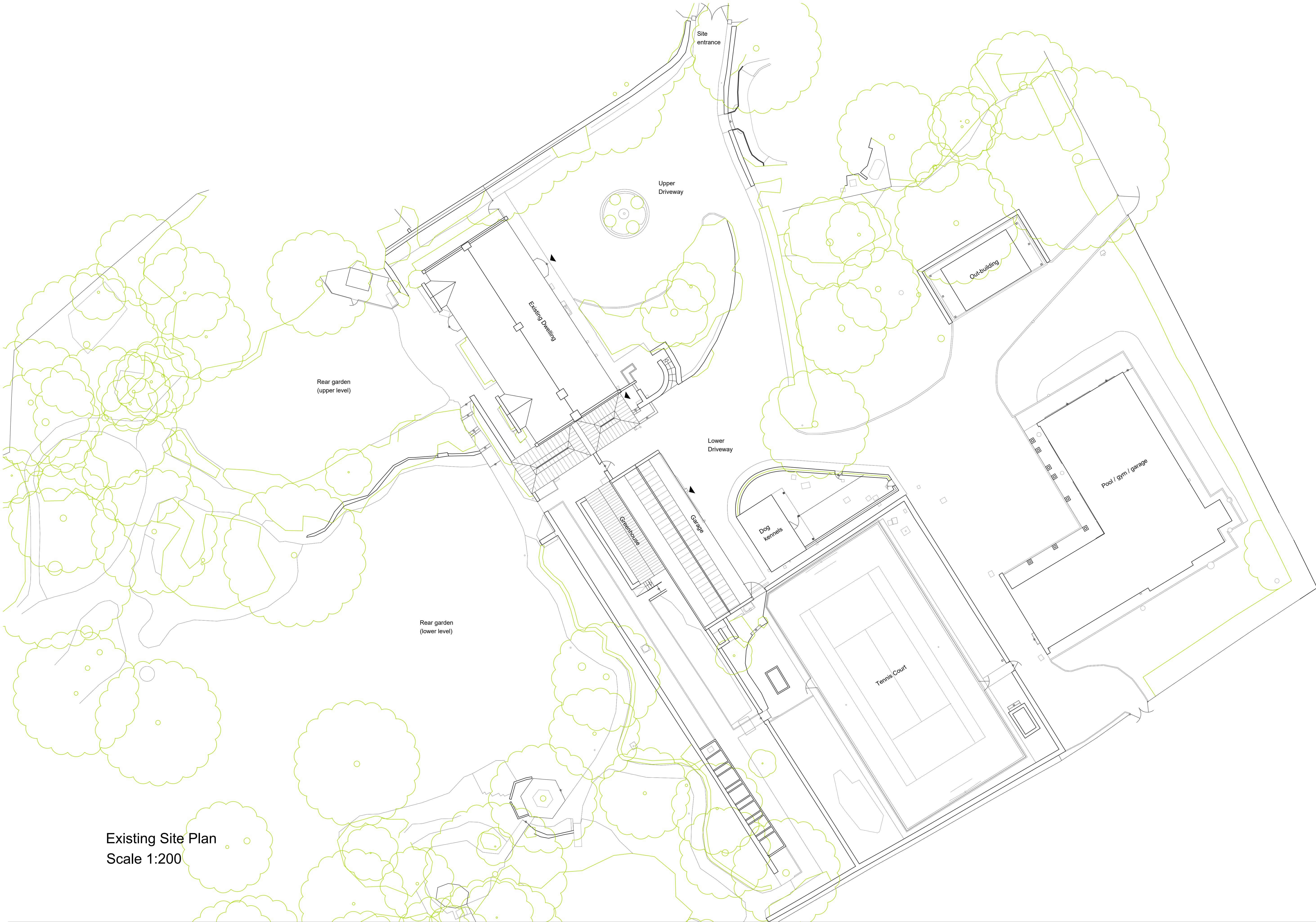
Existing Site Plan Scale 1:200

Notes This drawing, together with the design it illustrates, is copyright, and may not be reproduced in any form without the written consent of Zara Moon Architects. Do not scale off this drawing except for determination of basic layout - only figured dimensions to be used. All dimensions to be checked on site.