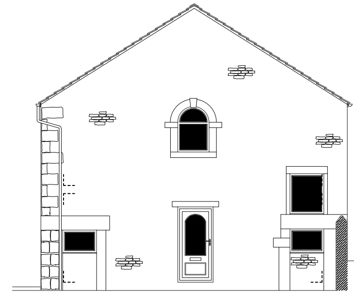
Existing South West Facing Elevation Scale 1:100