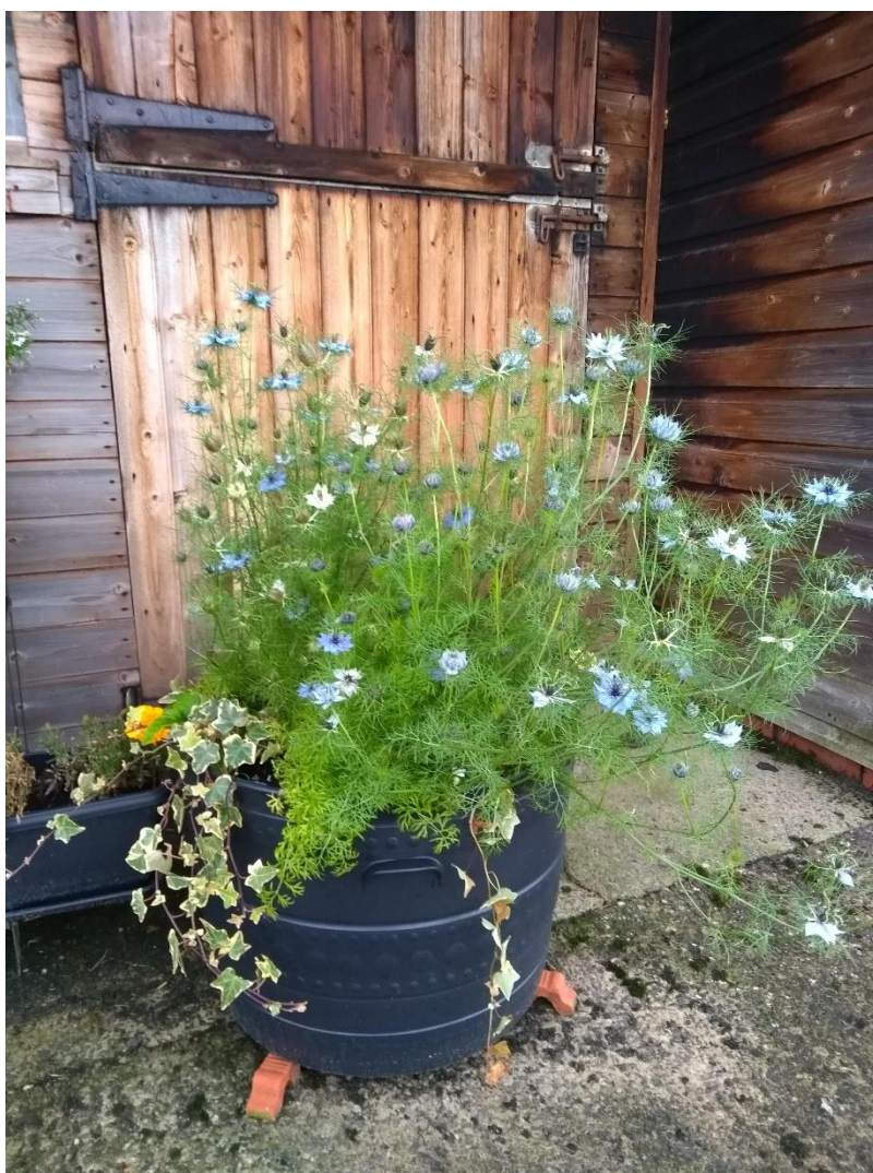
9 Plant display 2018