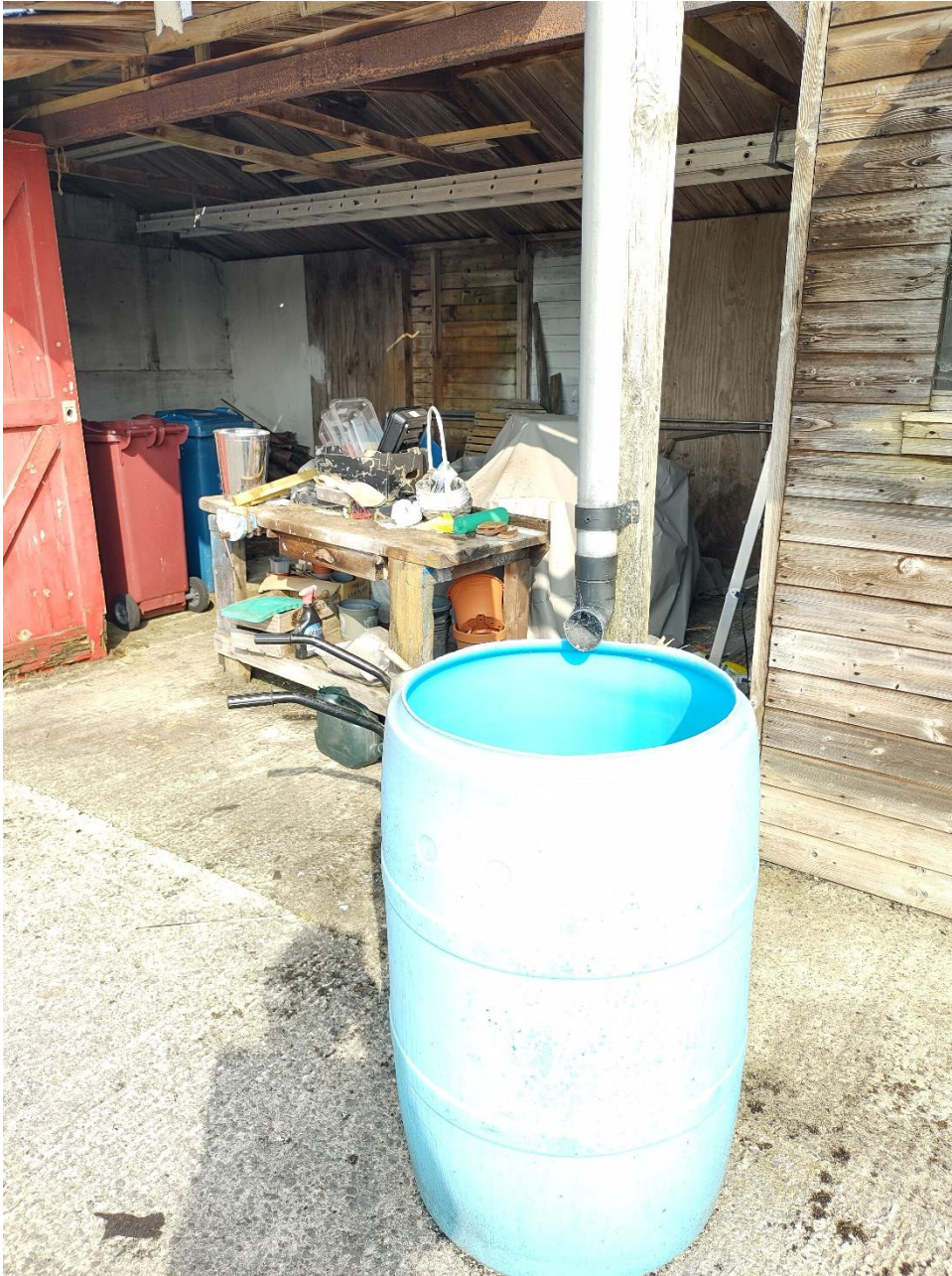
1. Interior of bin store.02/08/2024