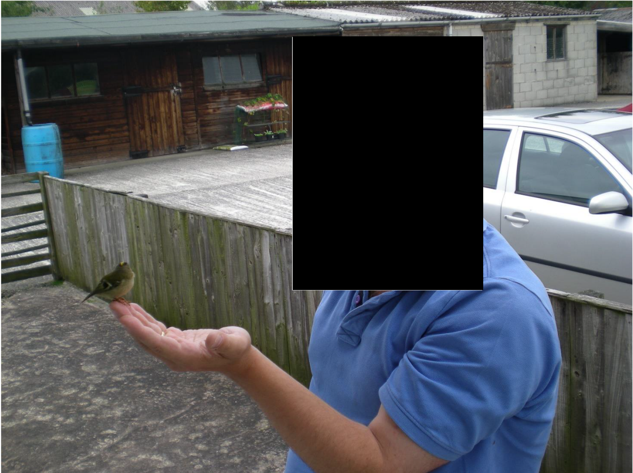
6 Silver car parked in yard date taken and plant display in front of garden store 09/09/2014