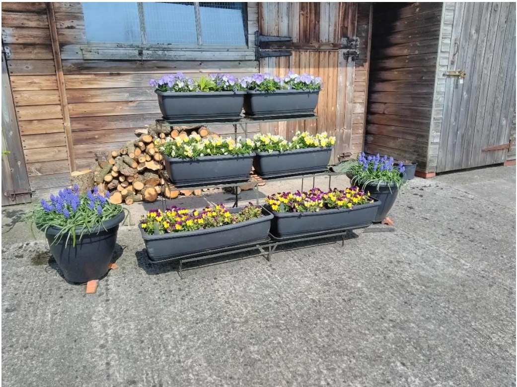
11 Plant display 2020