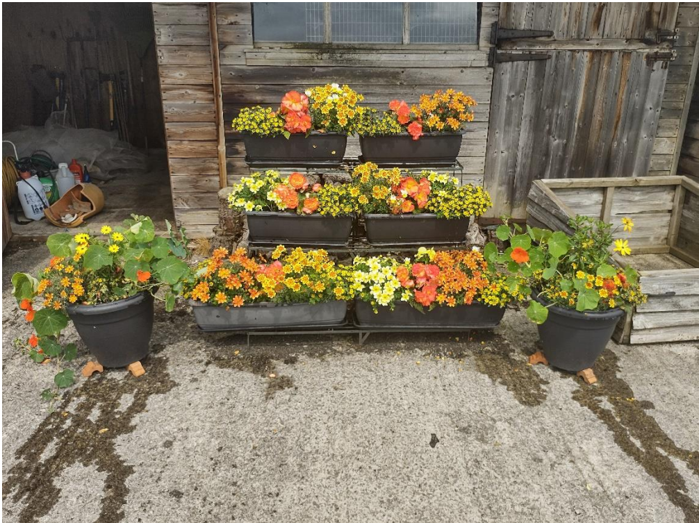
15 Plant display 2024