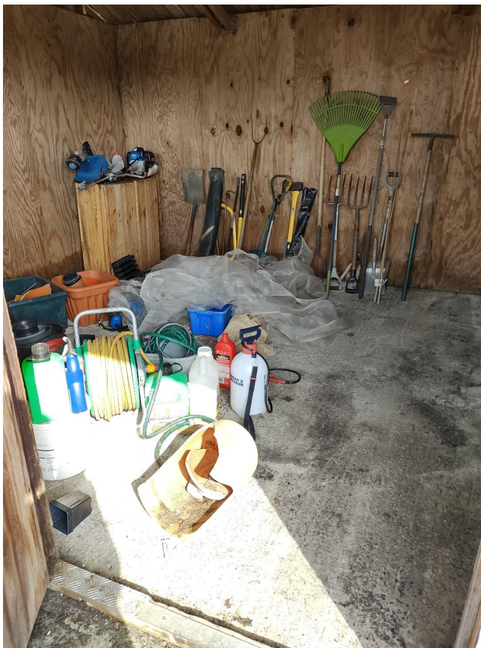
2 Interior of garden store. 02/08/2024