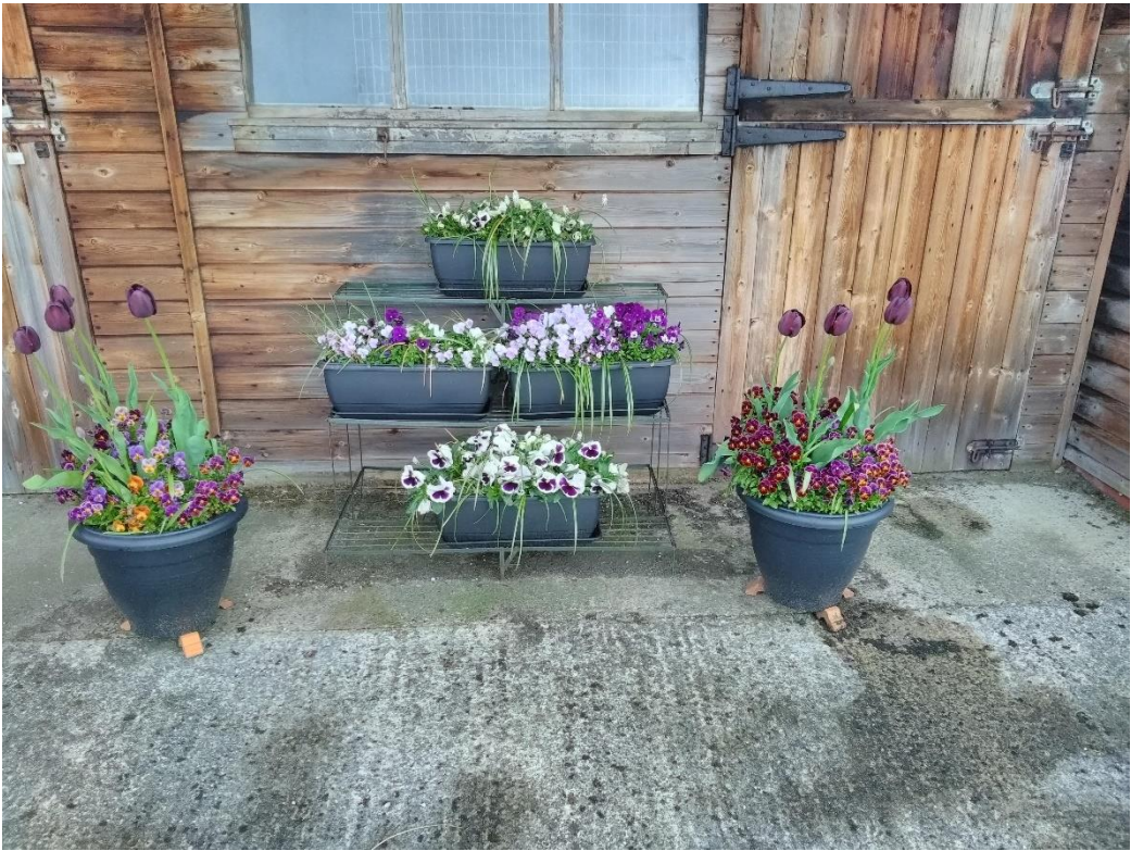
10 Plant display 2019