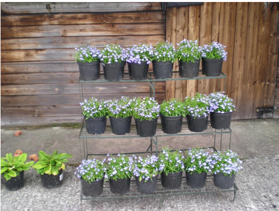
7 Plant display 2015