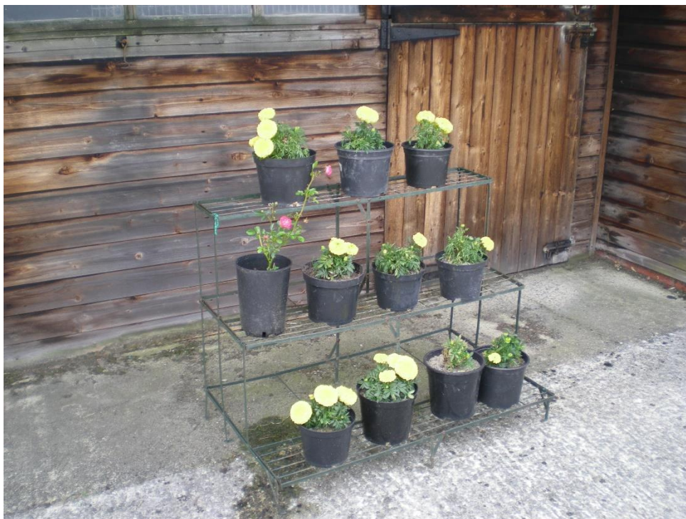
8 Plant display 2017