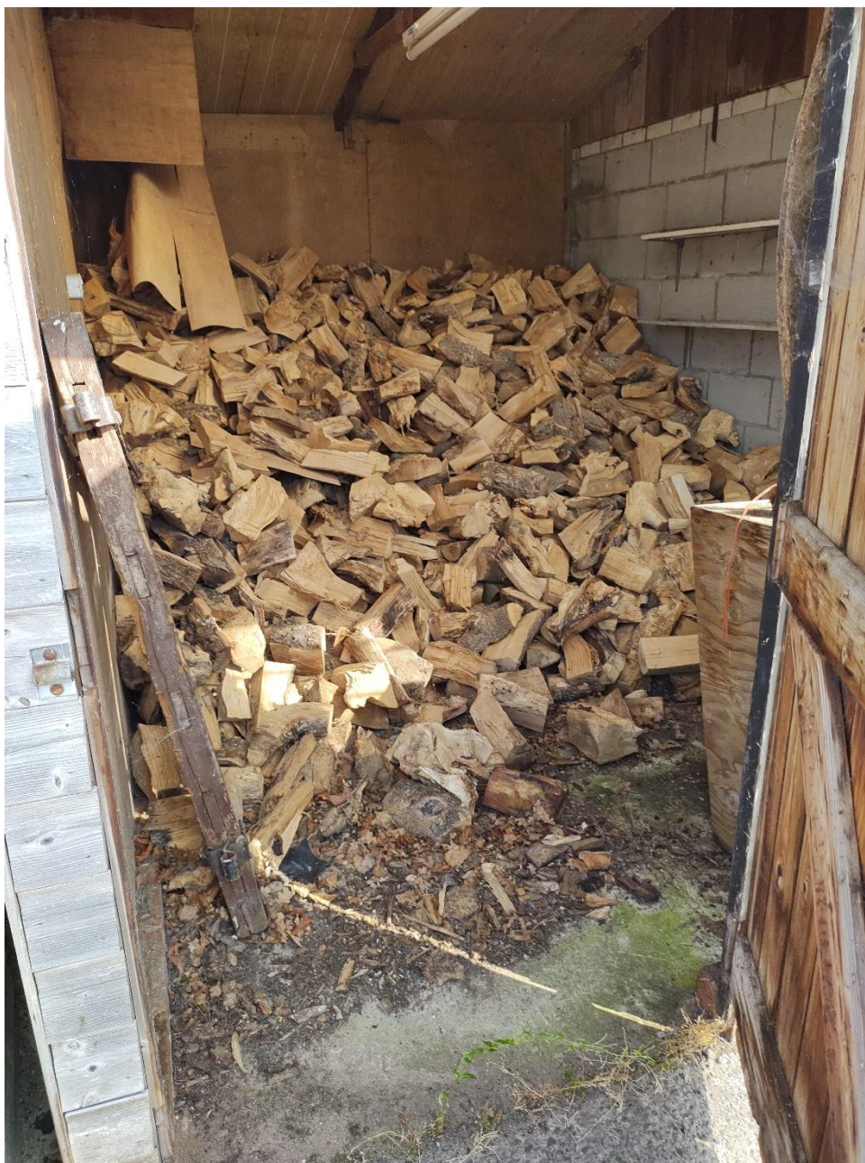
3 Interior of wood store. 02/08/2024