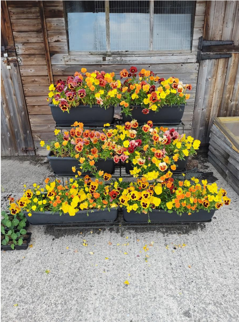
12 Plant display 2021