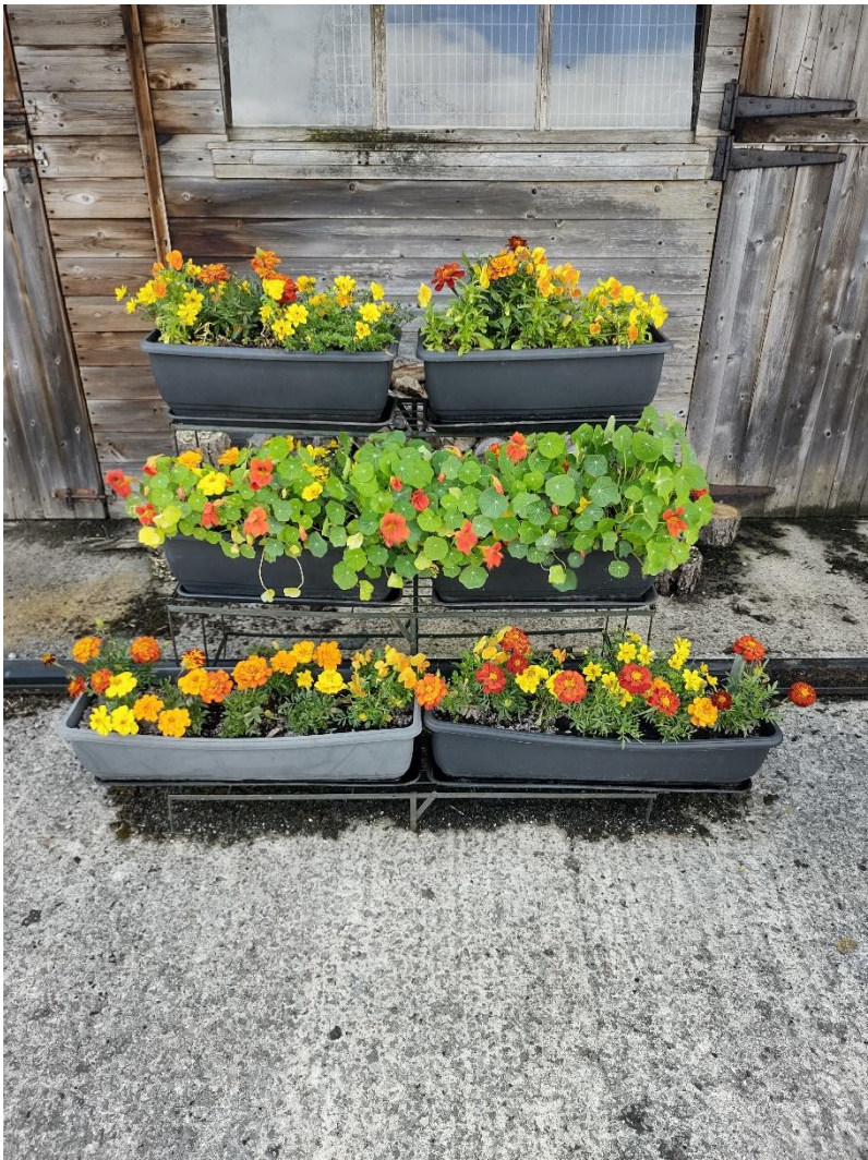
14 Plant display 2023.