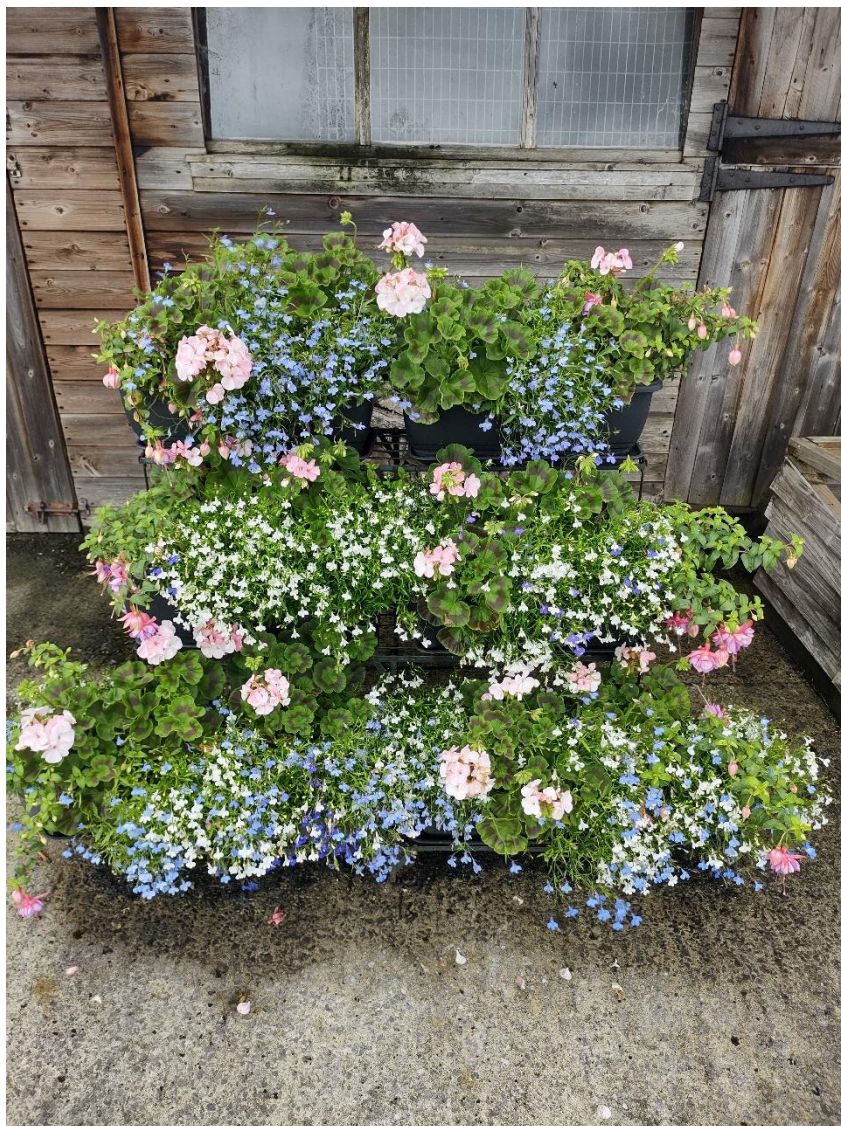
13 Plant display 2022