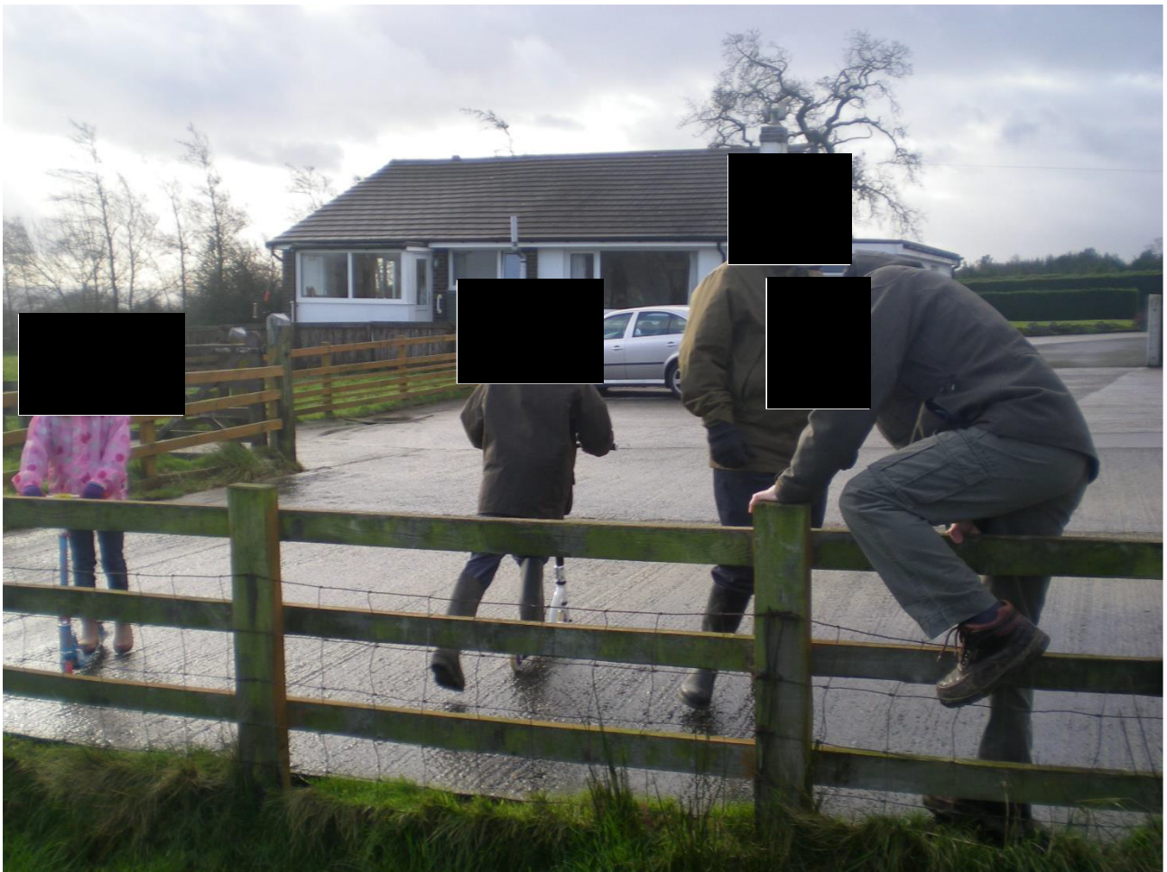
5 Silver car parked in the yard taken 07/01/2012