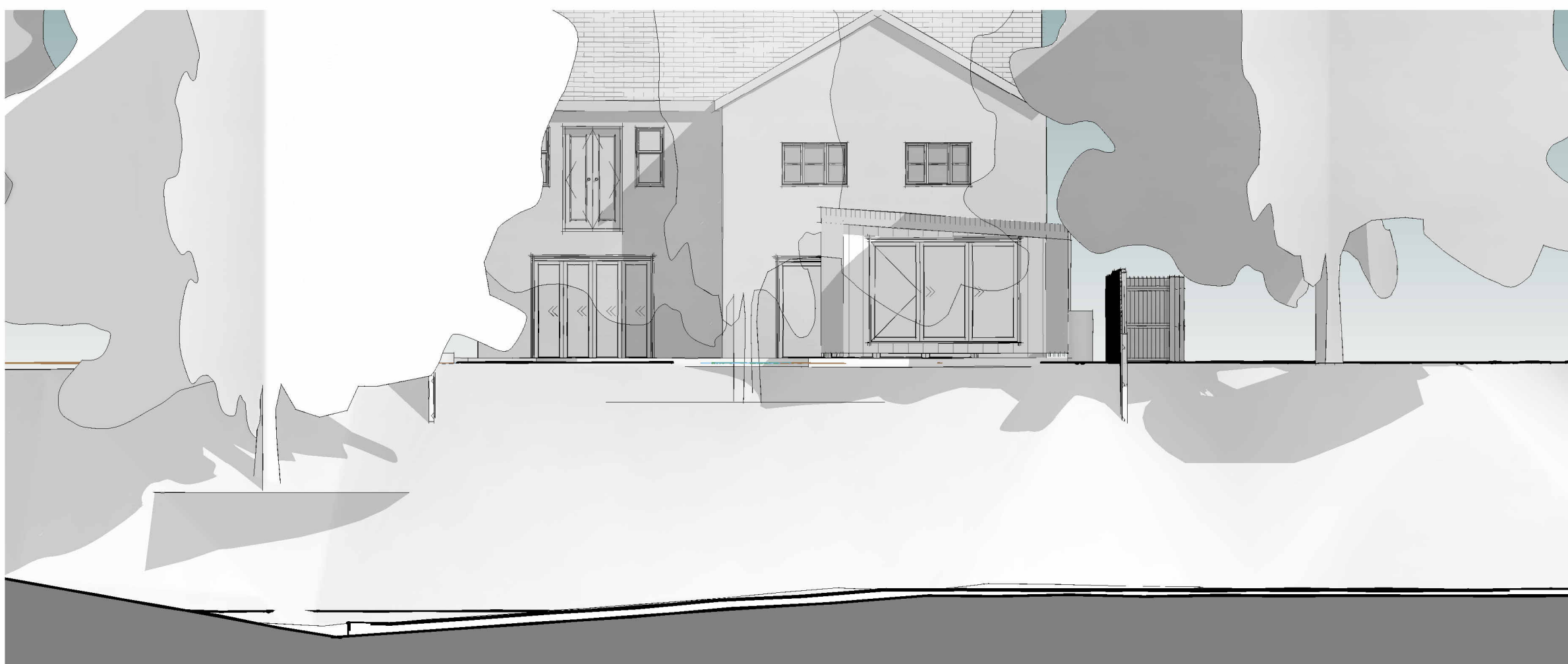
5 SOUTH EAST SECTION ELEVATION 1 : 100