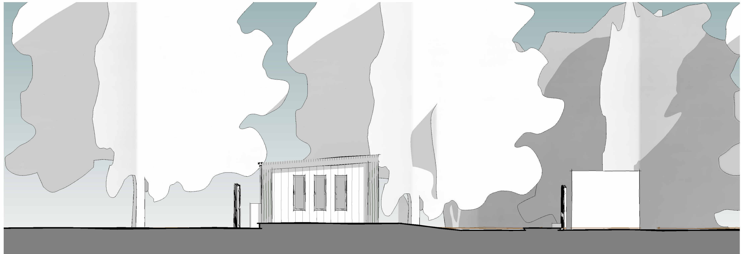
2 NORTH WEST SECTION ELEVATION 1 : 100