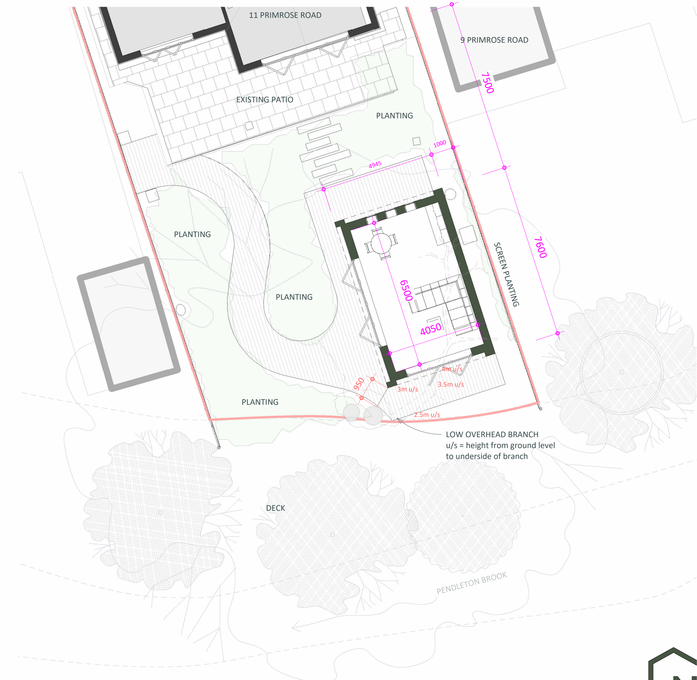
1 PROPOSED GROUND FLOOR 1 : 100