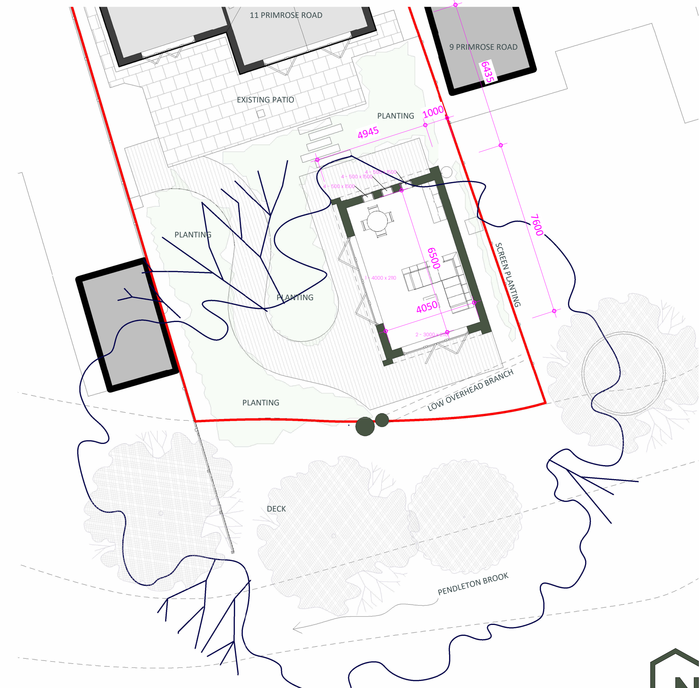
1 PROPOSED GROUND FLOOR 1 : 100