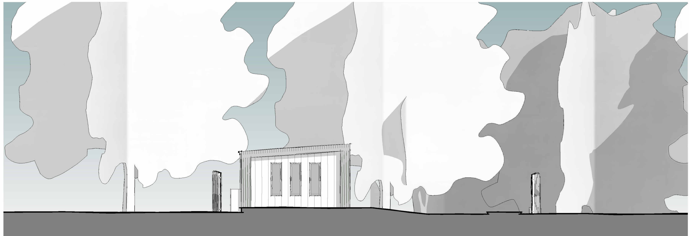
2 NORTH WEST SECTION ELEVATION 1 : 100