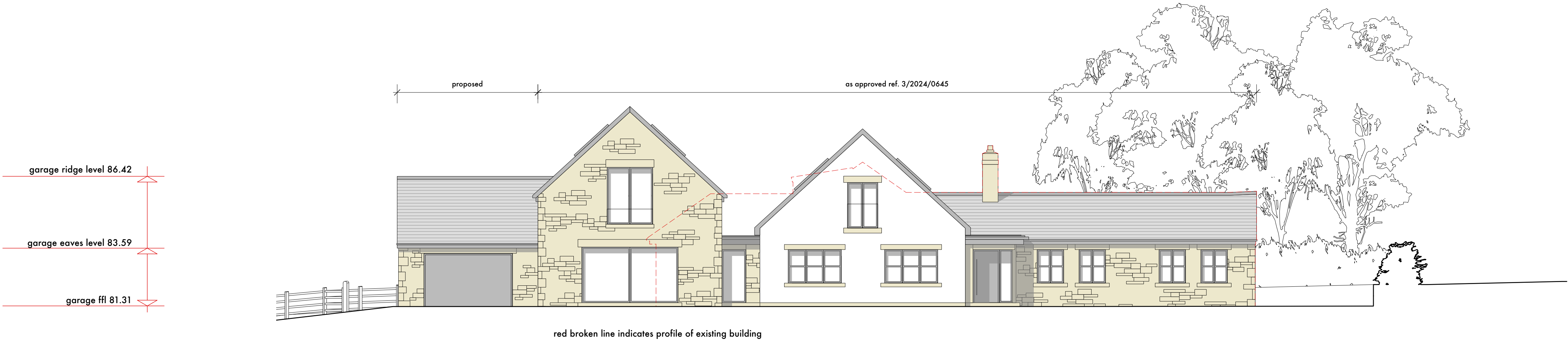
north west elevation