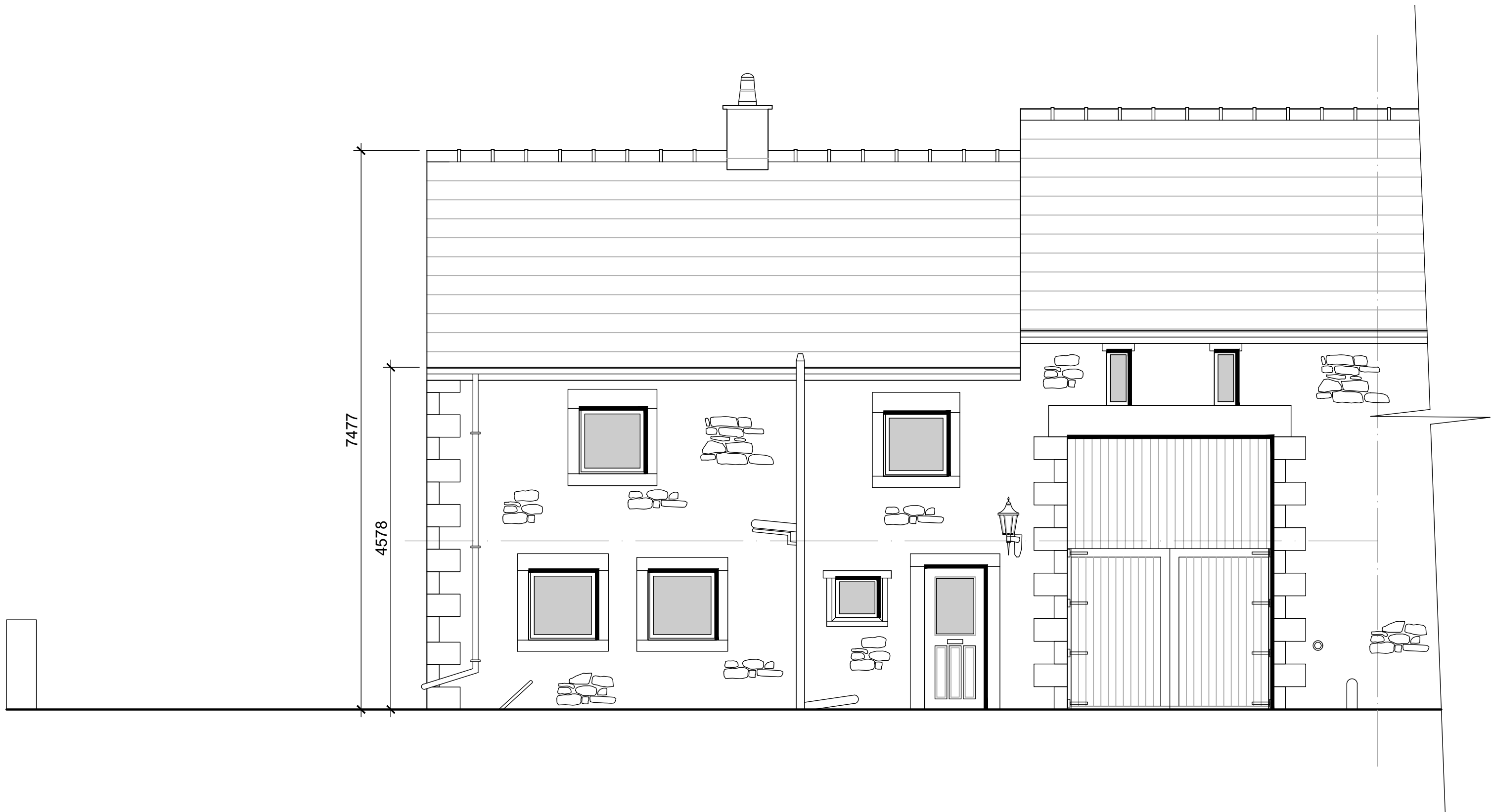
North Elevation 1:50 Scale