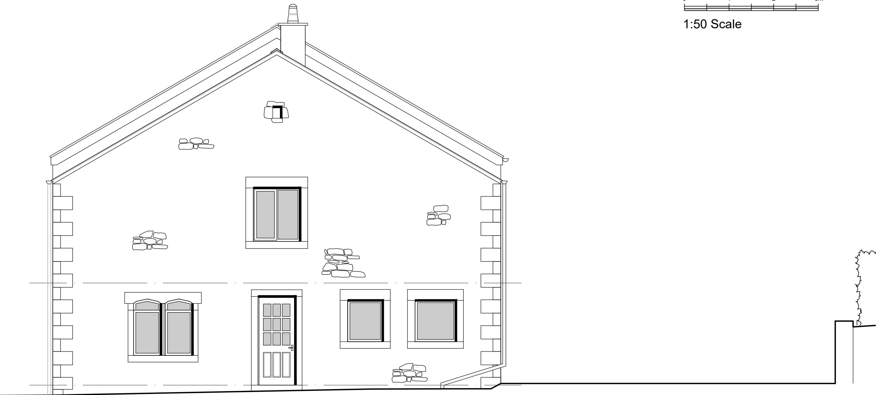
East Elevation 1:50 Scale