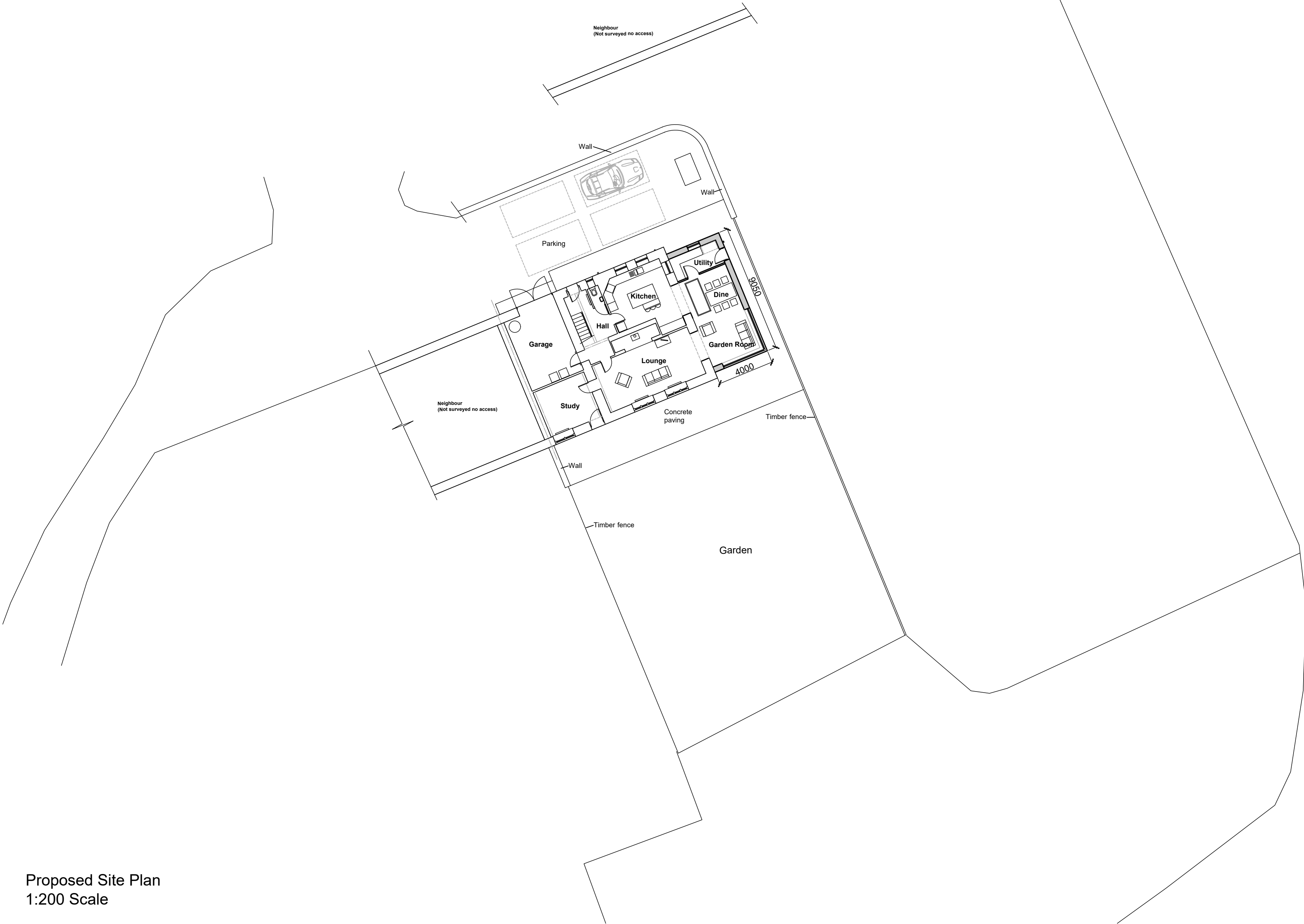
Proposed Site Plan 1:200 Scale