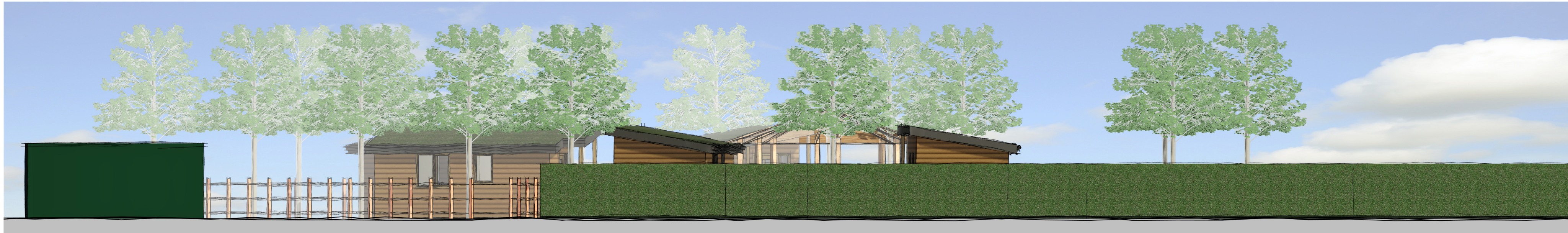
STREET SCENE A-A 1:100