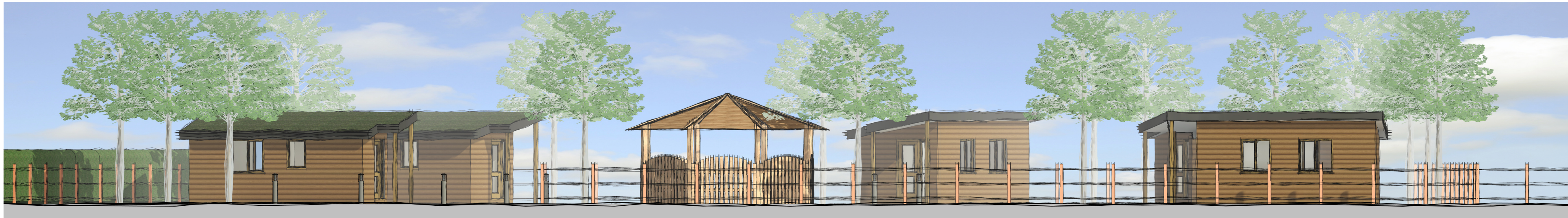
STREET SCENE B-B 1:100