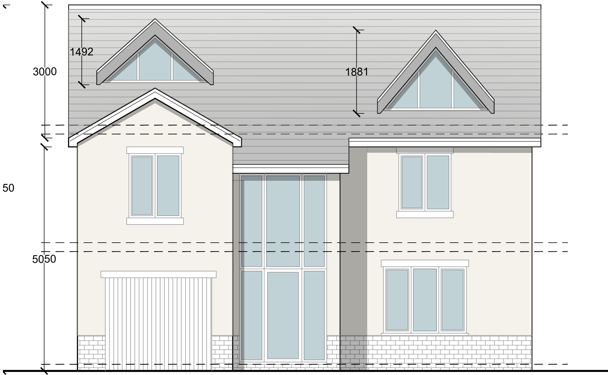
PROPOSED FRONT ELEVATION - 1:100