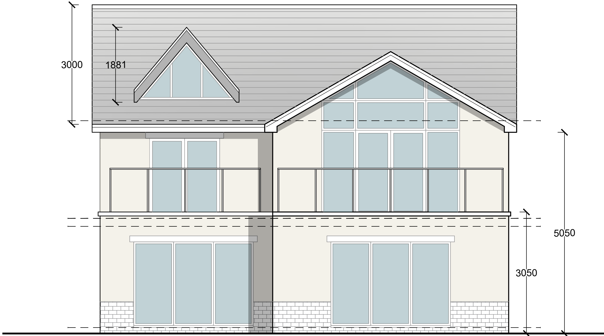
PROPOSED REAR ELEVATION - 1:100