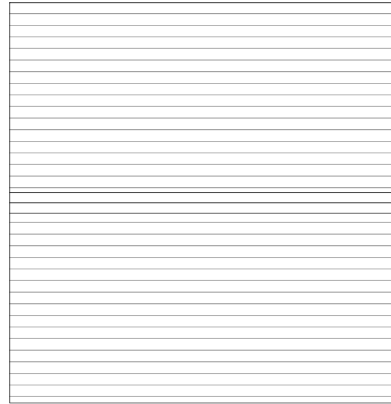
Woodfield Roof Plan As Existing 1:100 @ A3