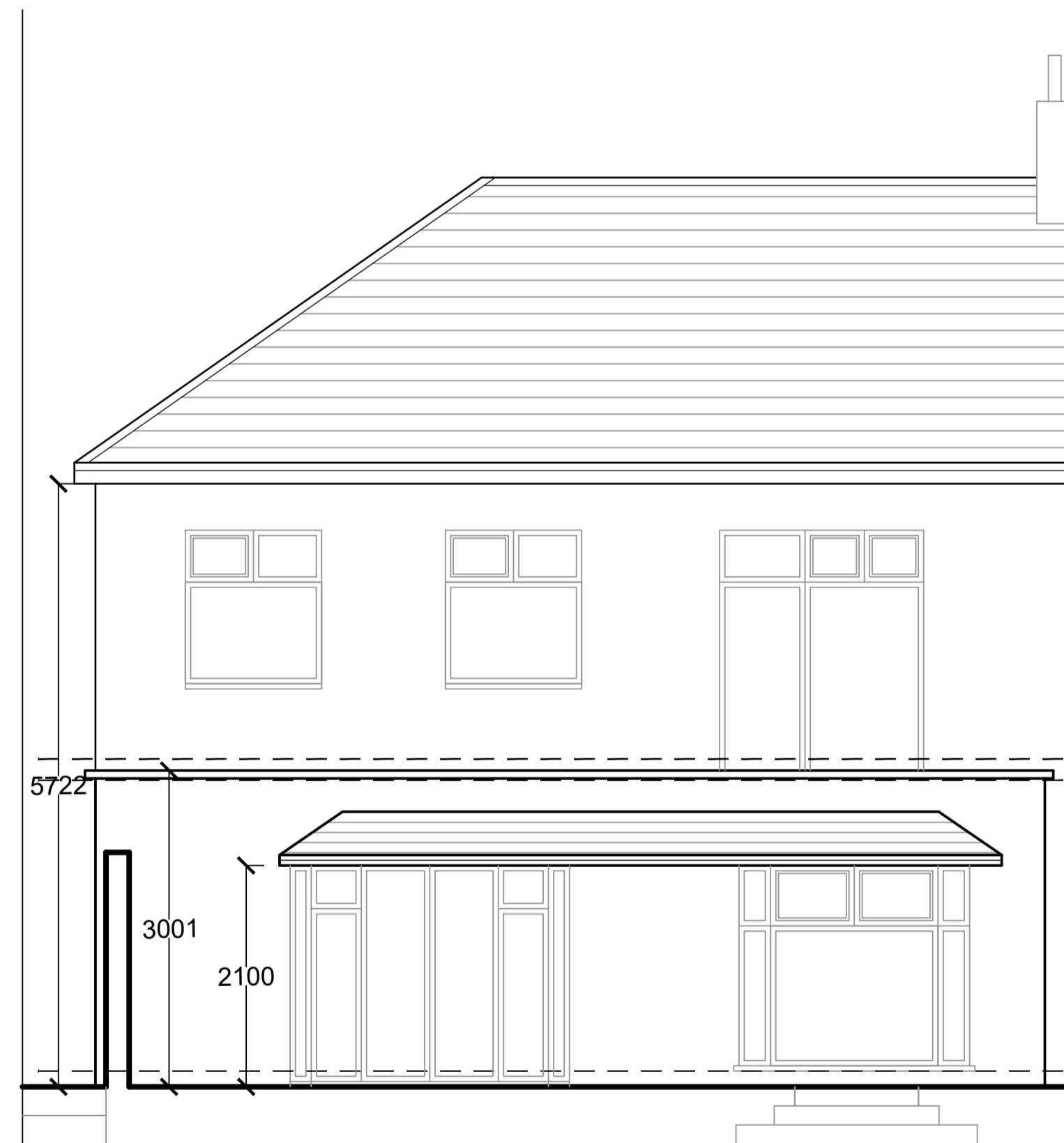
EXISTING REAR ELEVATION - 1:50