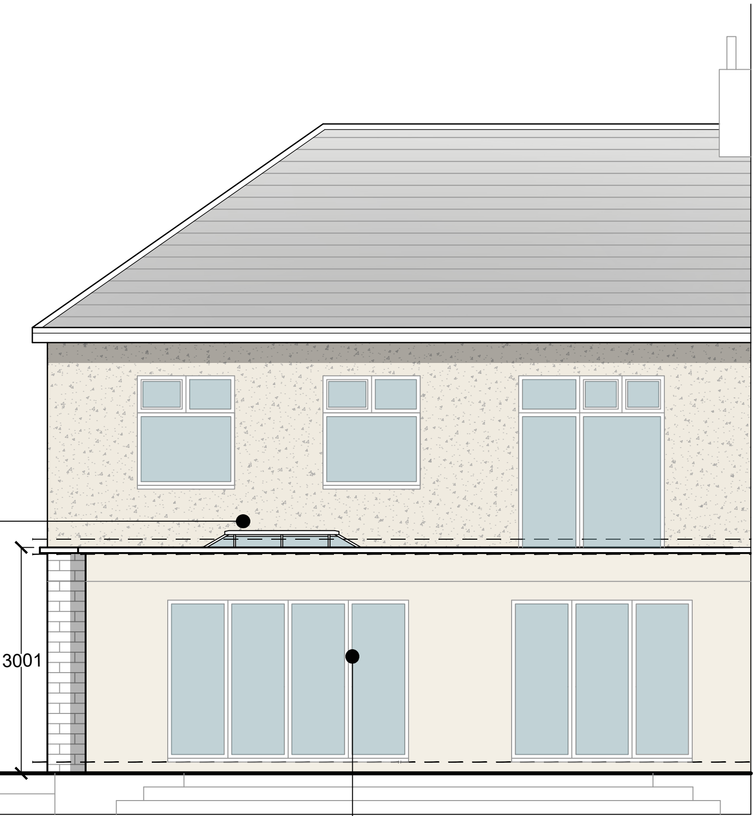
PROPOSED REAR ELEVATION - 1:50

New bi fold doors to be in black aluminium profile finish