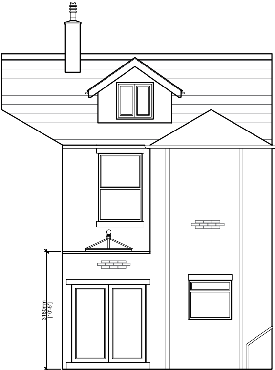
Proposed North East Facing Elevation Scale 1:100