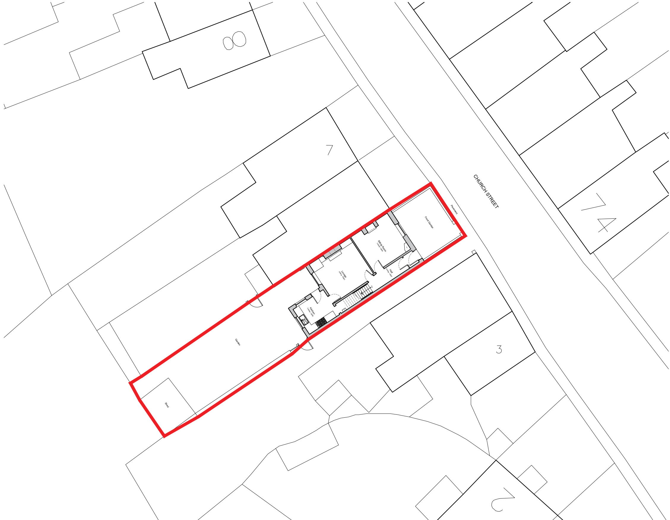
Existing Site Plan Scale 1:200

This drawing is to be read in conjunction with all relevant Architect, consultants' and specialists' drawings and specifications. The Architect is to be notified of any discrepancies before proceeding. Do not scale from this drawing. All dimensions and levels are to be checked on site. This drawing is subject to copyright. All work carried out before Planning and Building Permission has been granted is at the contractor/clients risk. Note: proposed drawing based on OS deq information. All illustrated dimensions are approximate and all site dimensions are to be checked on site and subject to site survey.