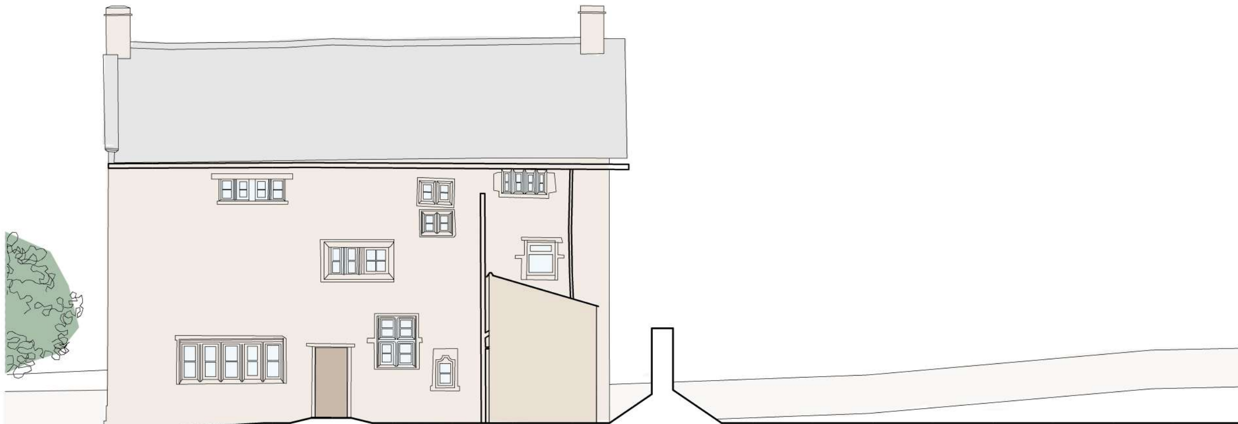
West Elevation Elevation C