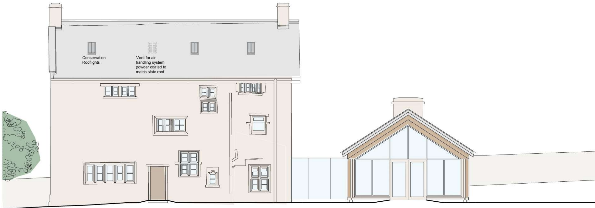
West Elevation Elevation C

DATE • 12.11.2024 DRAWN • RL SCALE • 1:100 CHECKED • LM