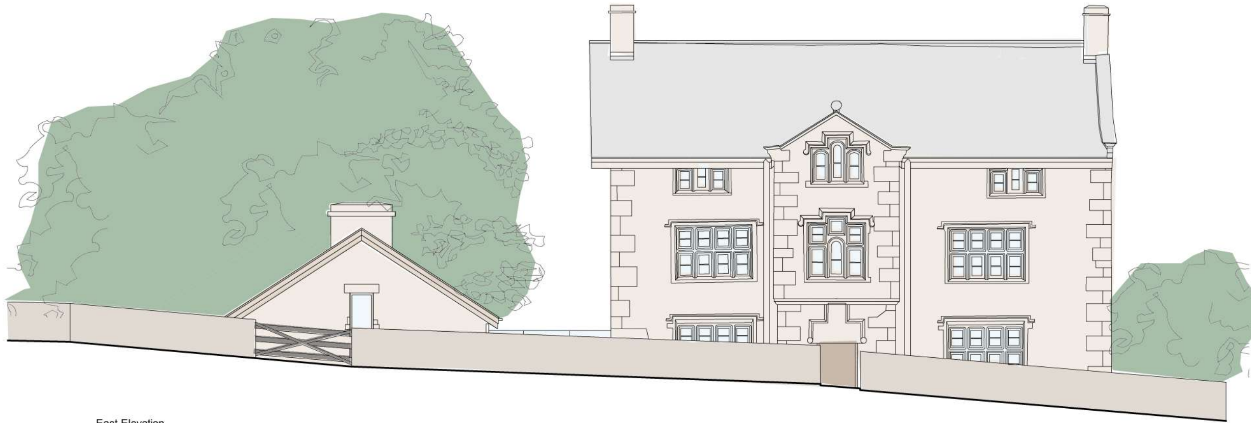
East Elevation Elevation A