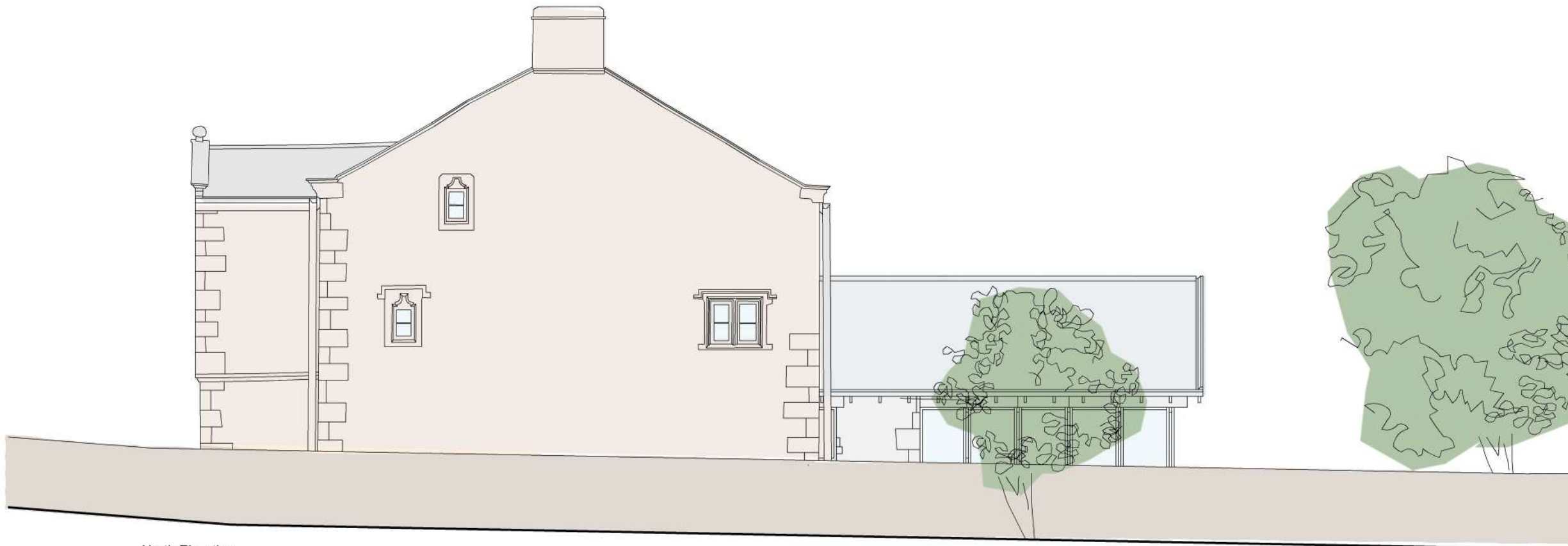
North Elevation Elevation D