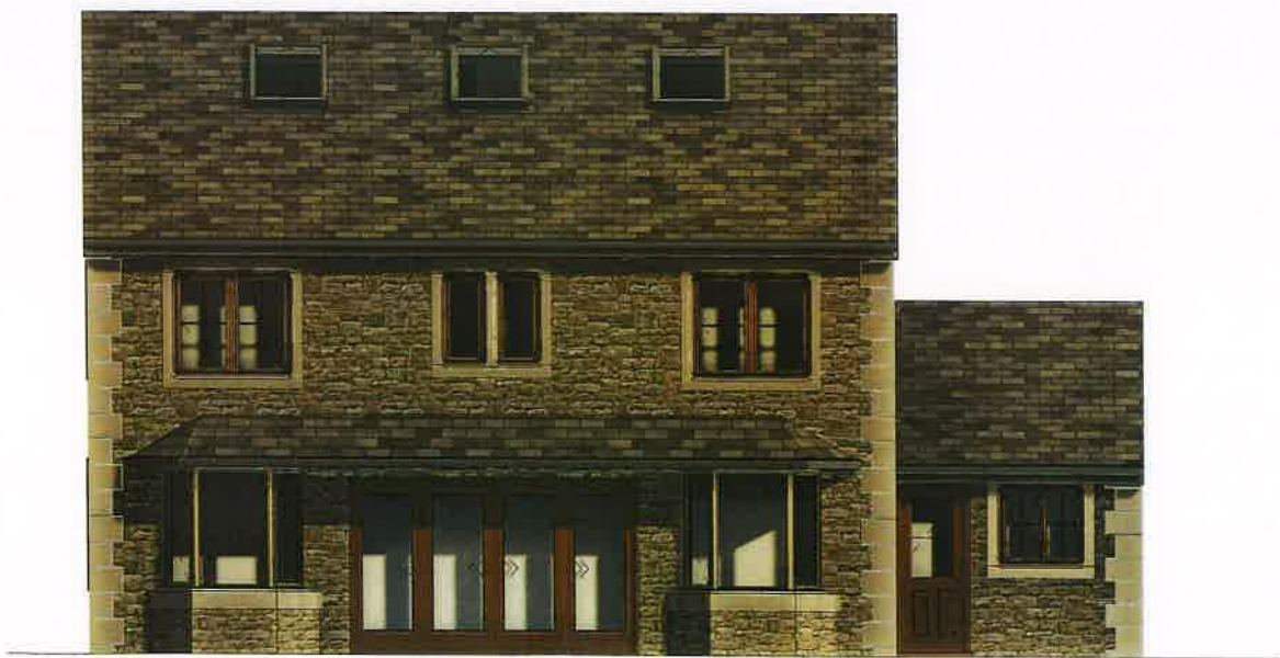
2 PROPOSED SOUTH EAST 1 : 50