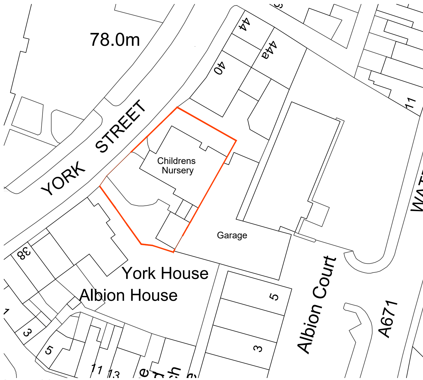
SITE BLOCK PLAN 1:500