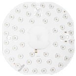
DD II ↪ P413