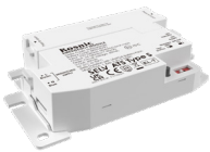
DD EME II 2 in 1 ↪ P67