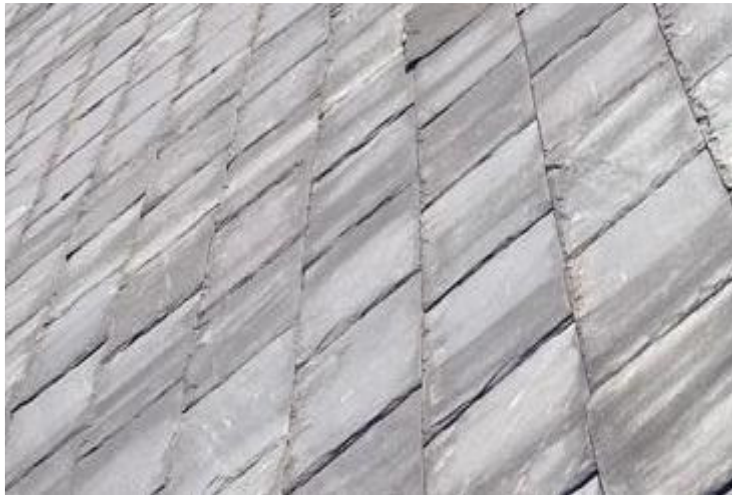
Natural slate roof covering ( existing roof slates removed from the front elevation to be used on the rear ).