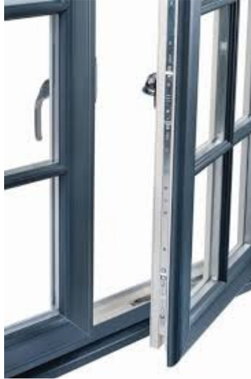
Anthracite upvc framed windows