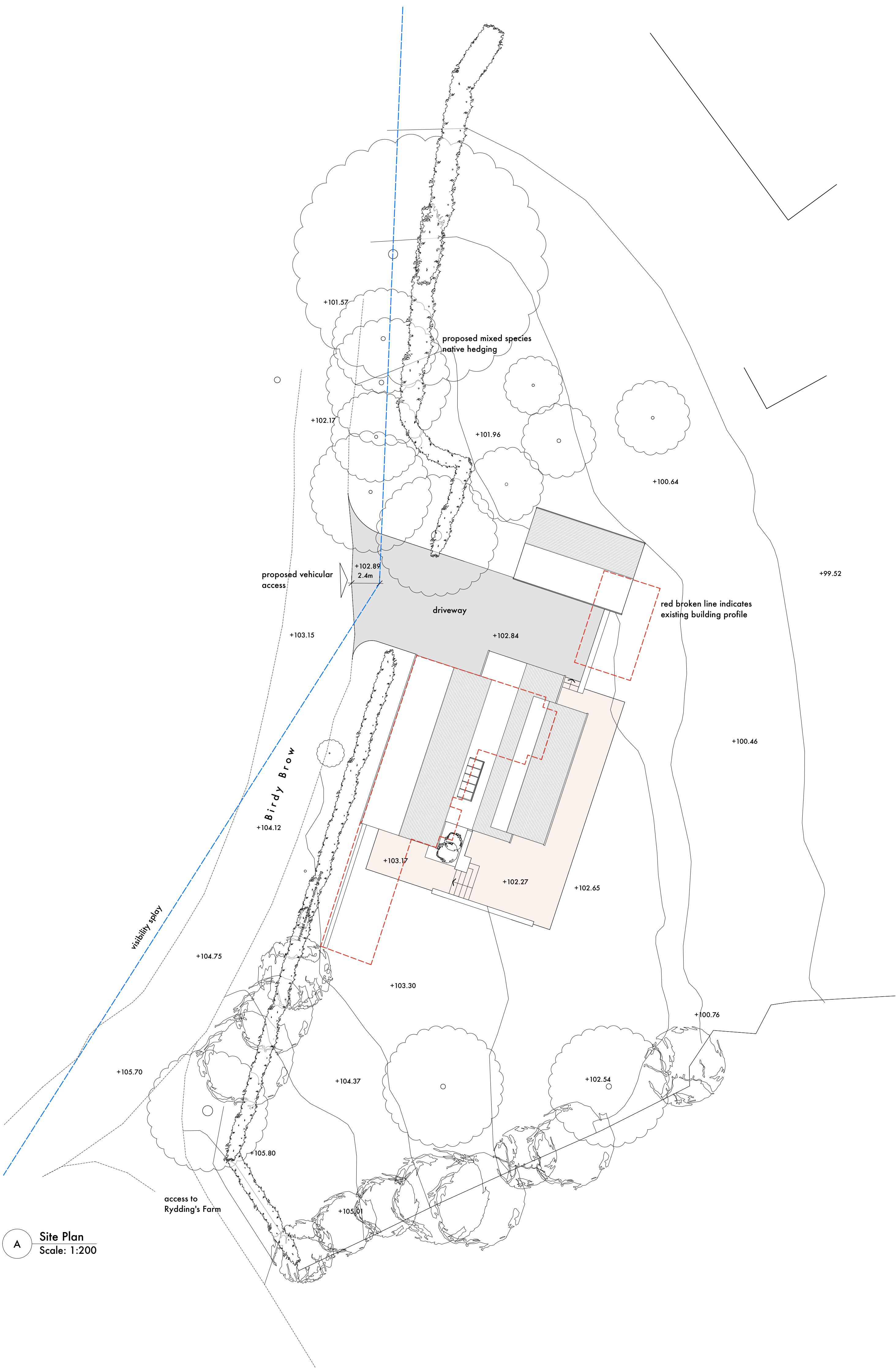
A Site Plan Scale: 1:200